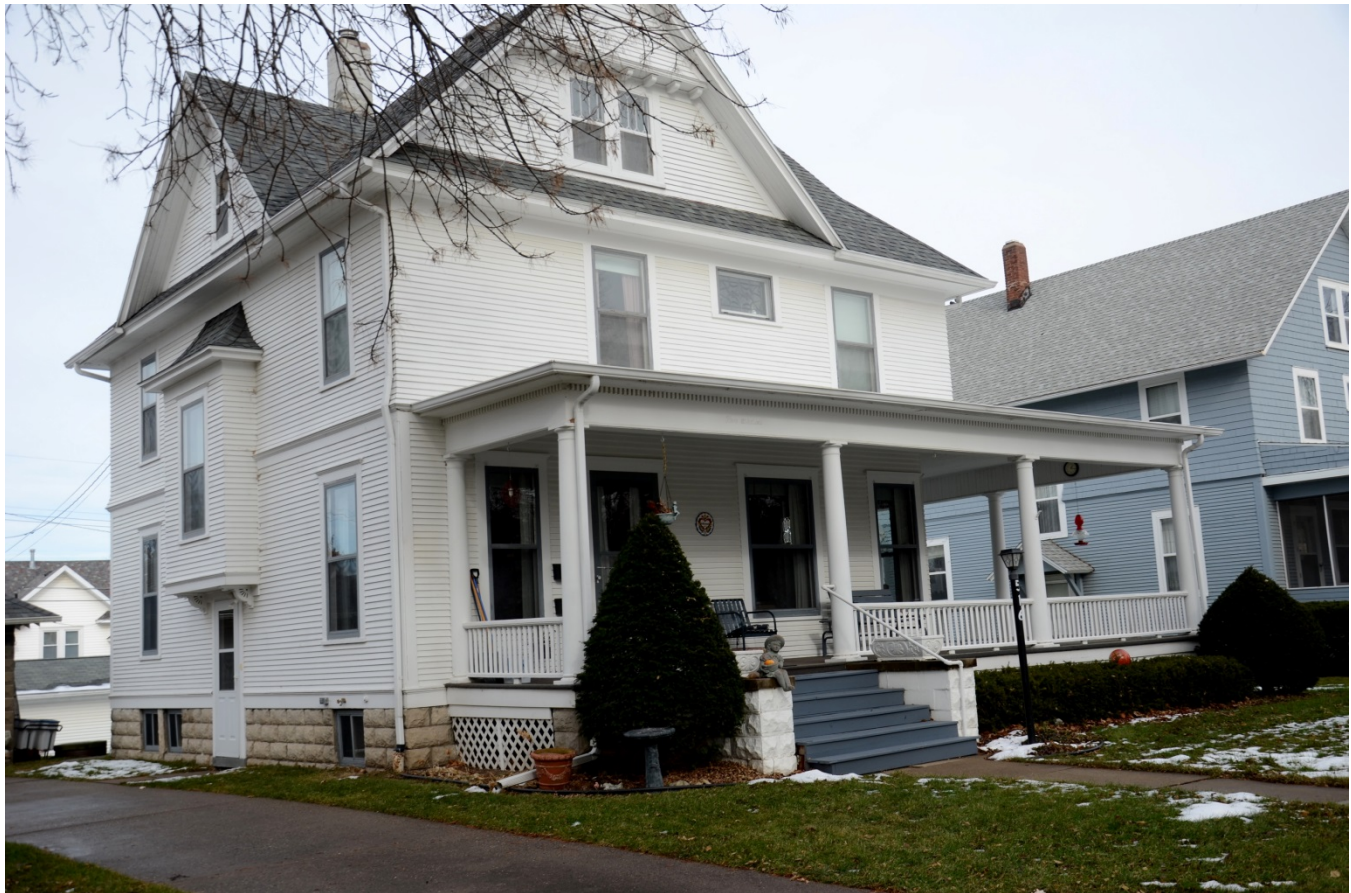
Photograph 92-00391-001 - House, looking northeast (December 2014)