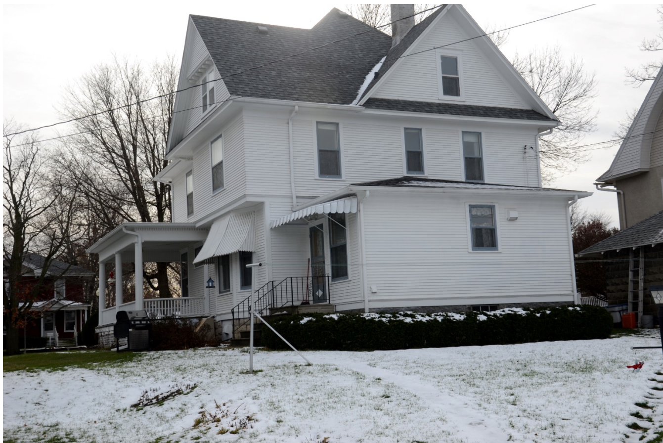
Photograph 92-00391-002 - House, looking southwest (December 2014)