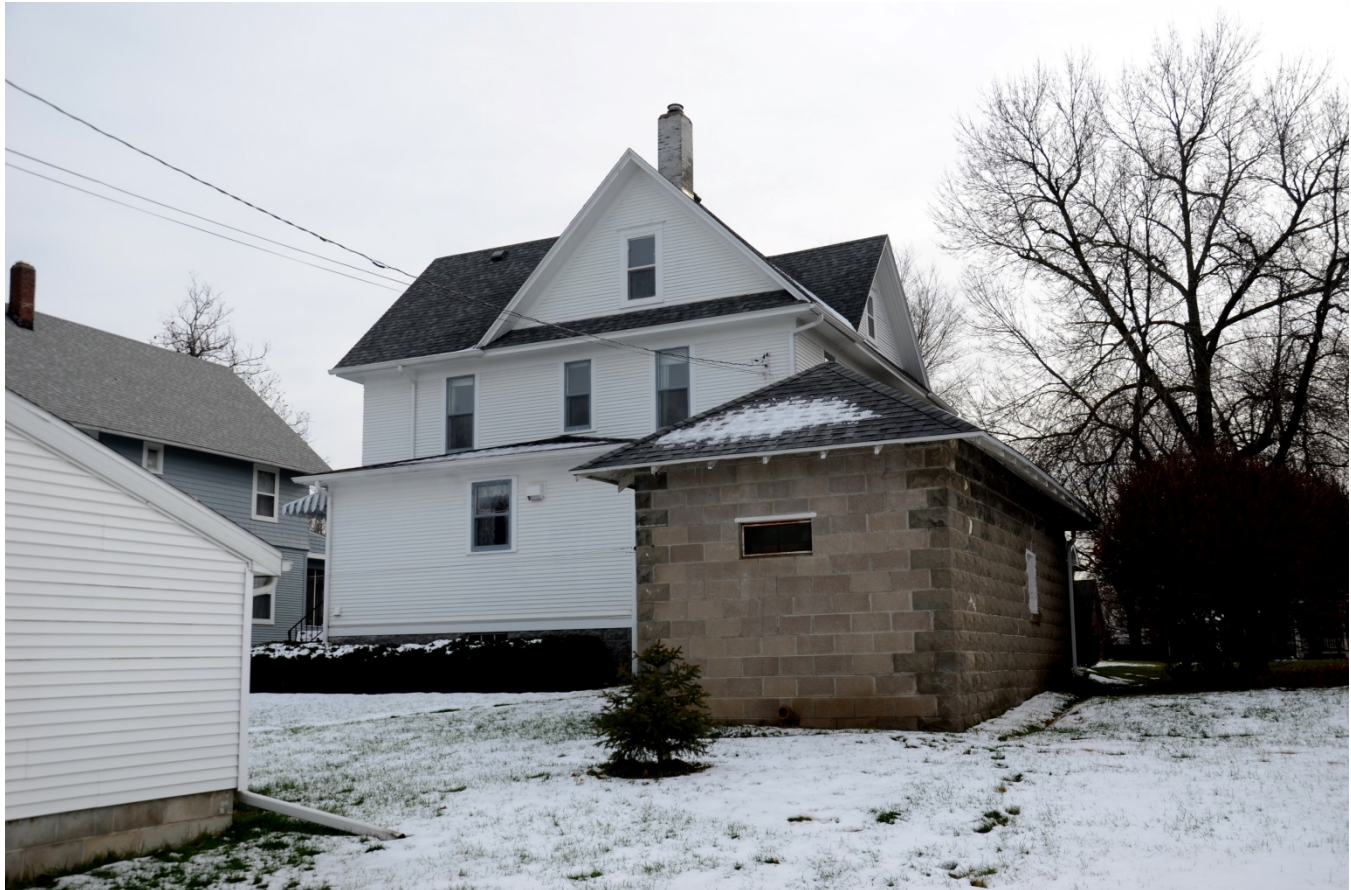
Photograph 92-00391-003 – House and garage, looking southeast (December 2014)