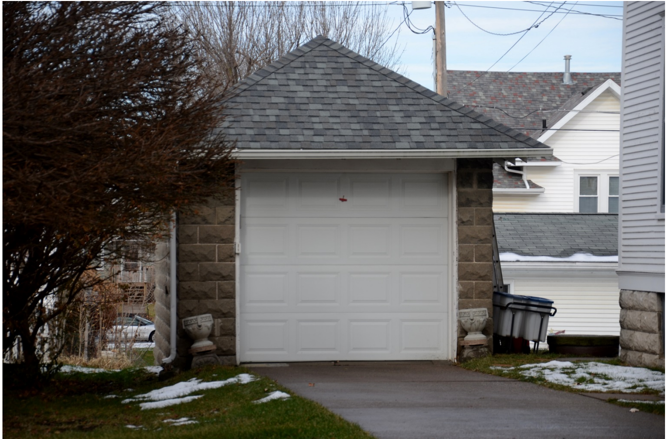
Photograph 92-00391-004 - Garage, looking north (December 2014)