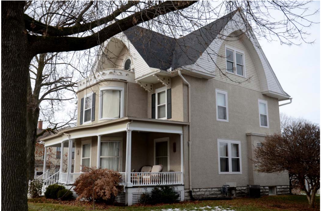
Photograph 92-00392-002 - House, looking northwest (December 2014)