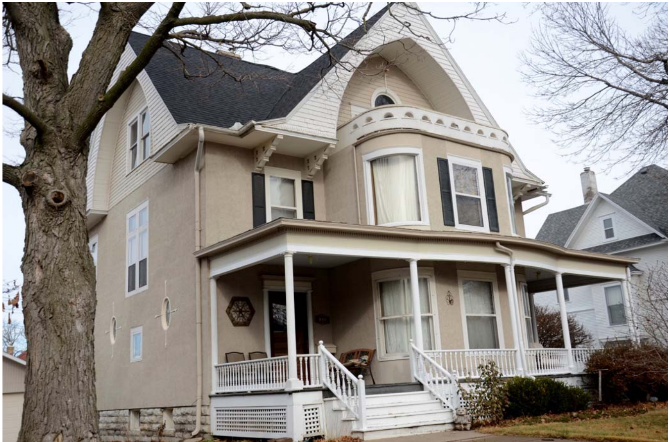
Photograph 92-00392-001 - House, looking northeast (December 2014)