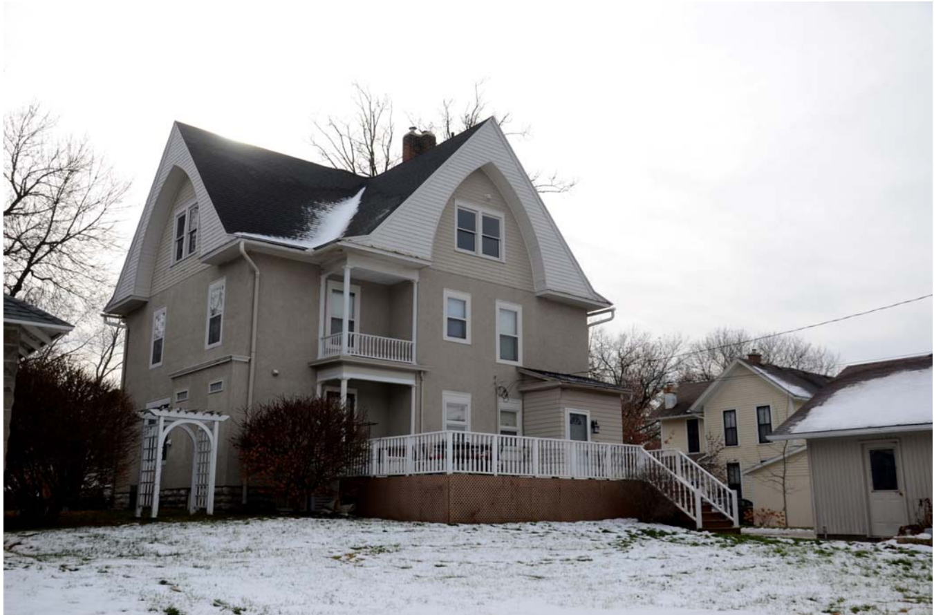
Photograph 92-00392-003 - House, looking southwest (December 2014)