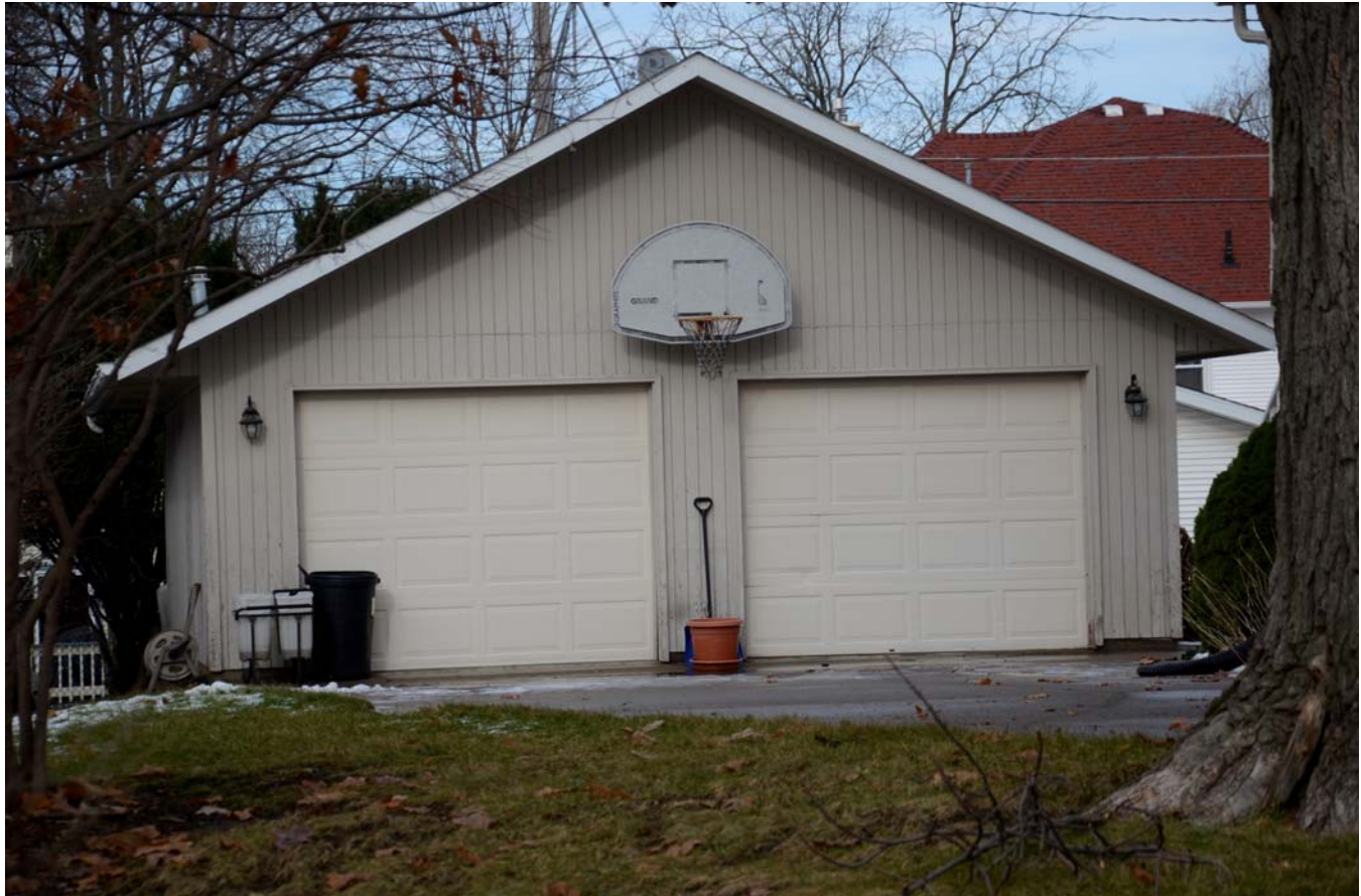
Photograph 92-00392-004 - House, looking north (December 2014)