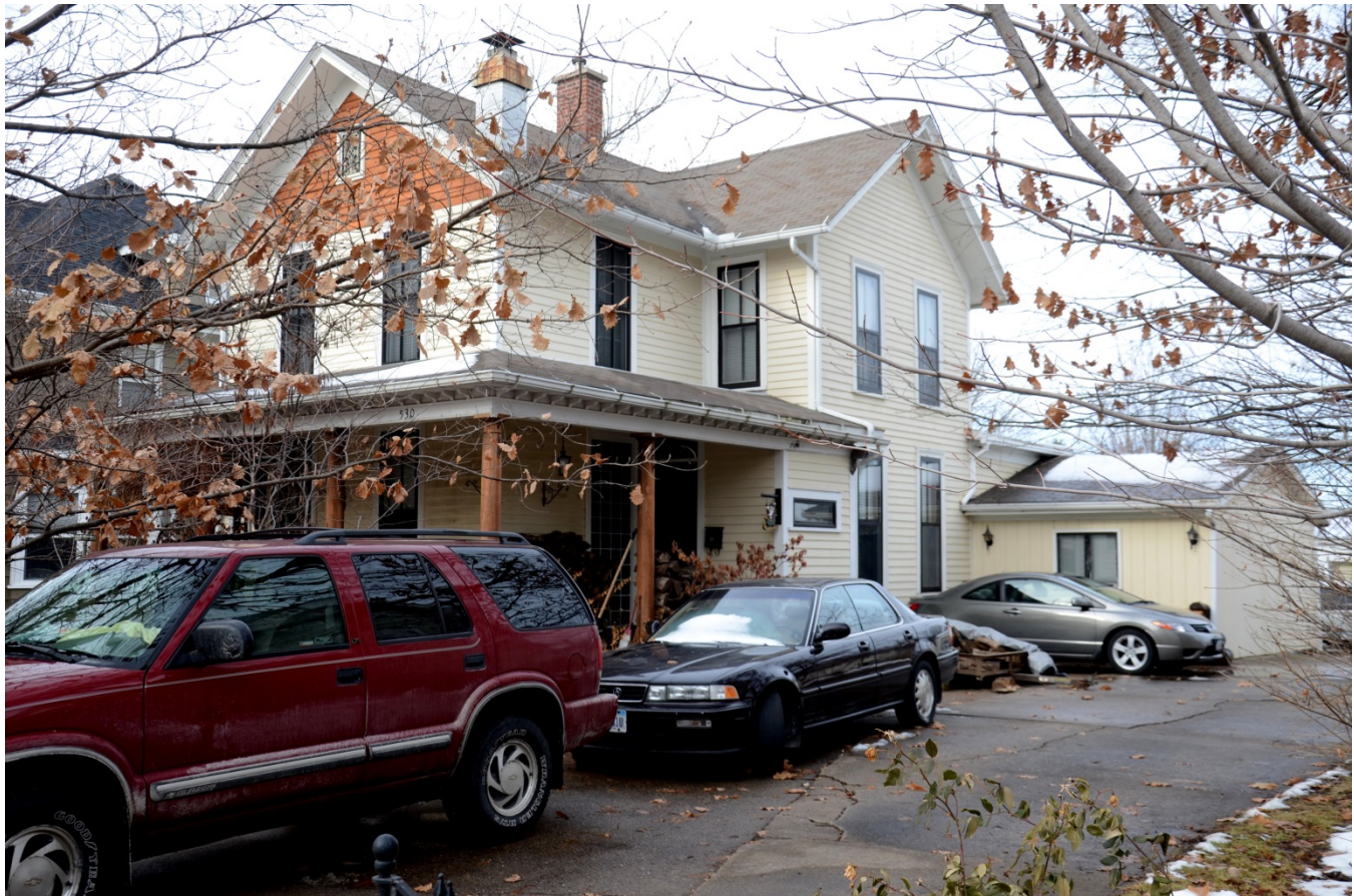
Photograph 92-00393-002 - House, looking northwest (December 2014)