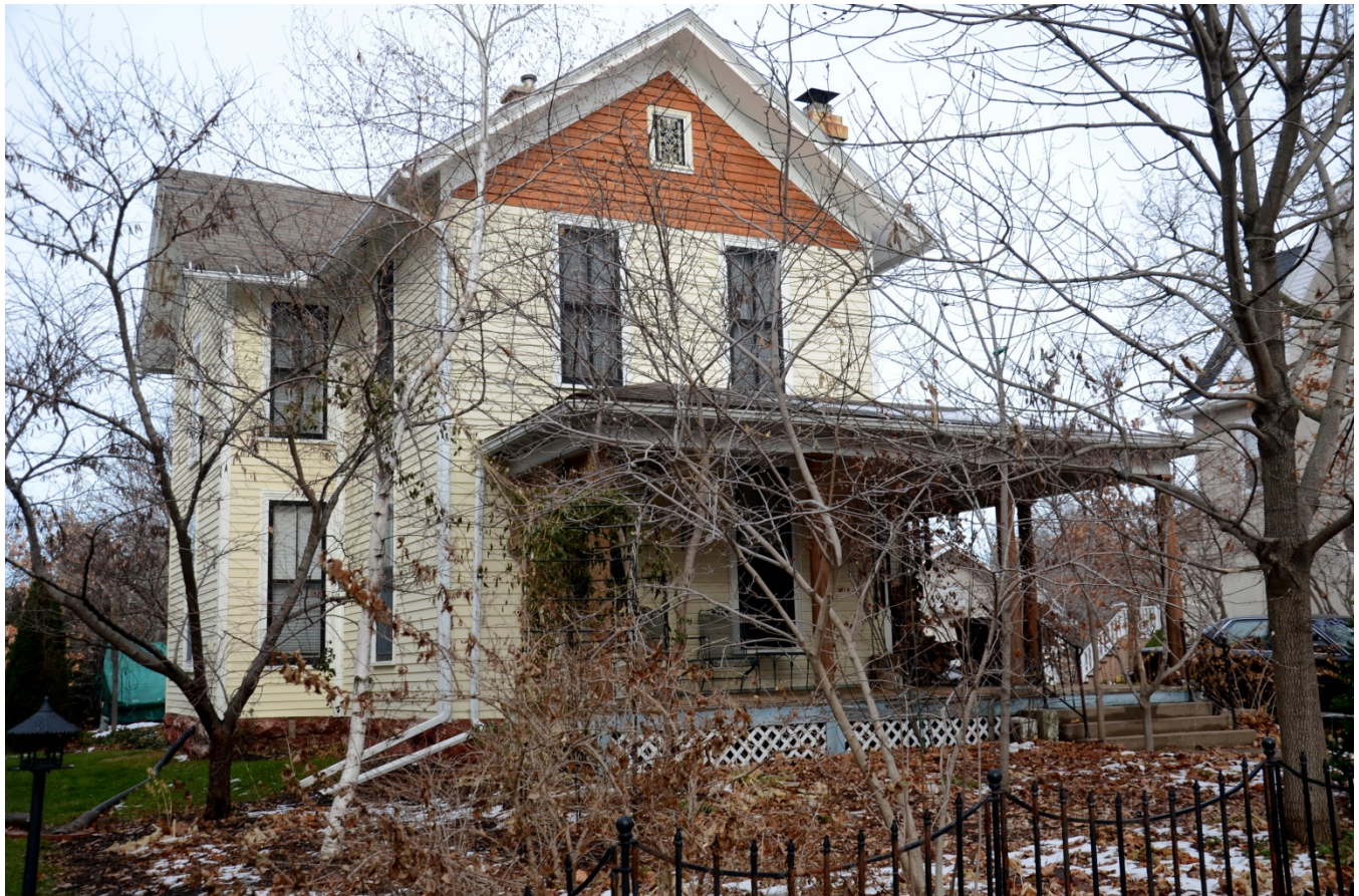
Photograph 92-00393-001 - House, looking northeast (December 2014)