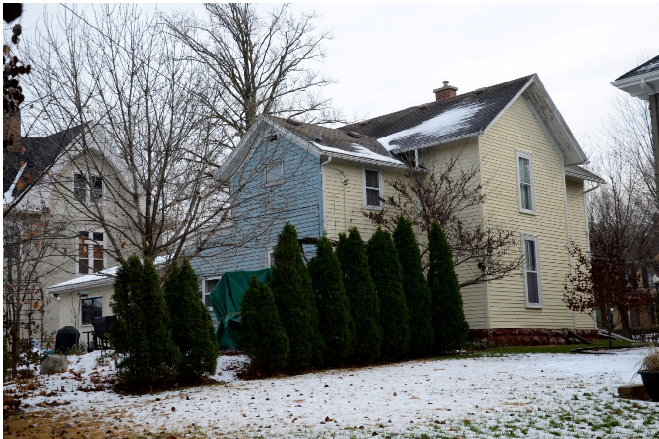
Photograph 92-00393-003 - House, looking southeast (December 2014)