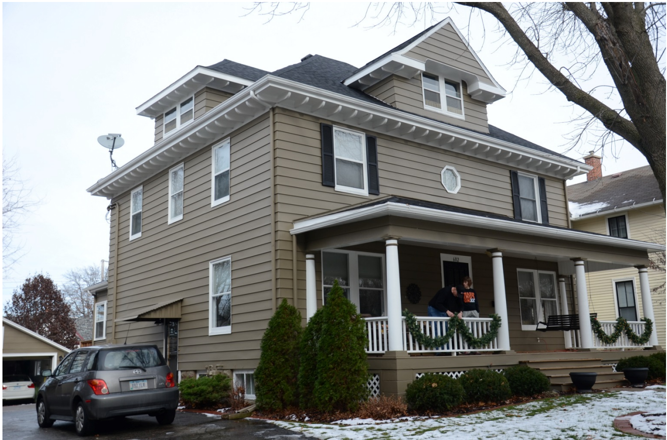
Photograph 92-00394-002 - House, looking northeast (December 2014)