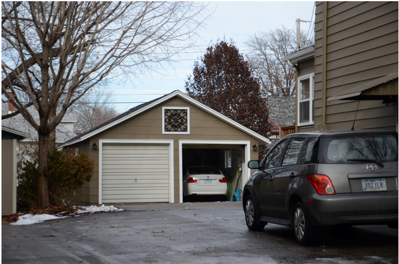
Photograph 92-00394-004 - Garage, looking north (December 2014)