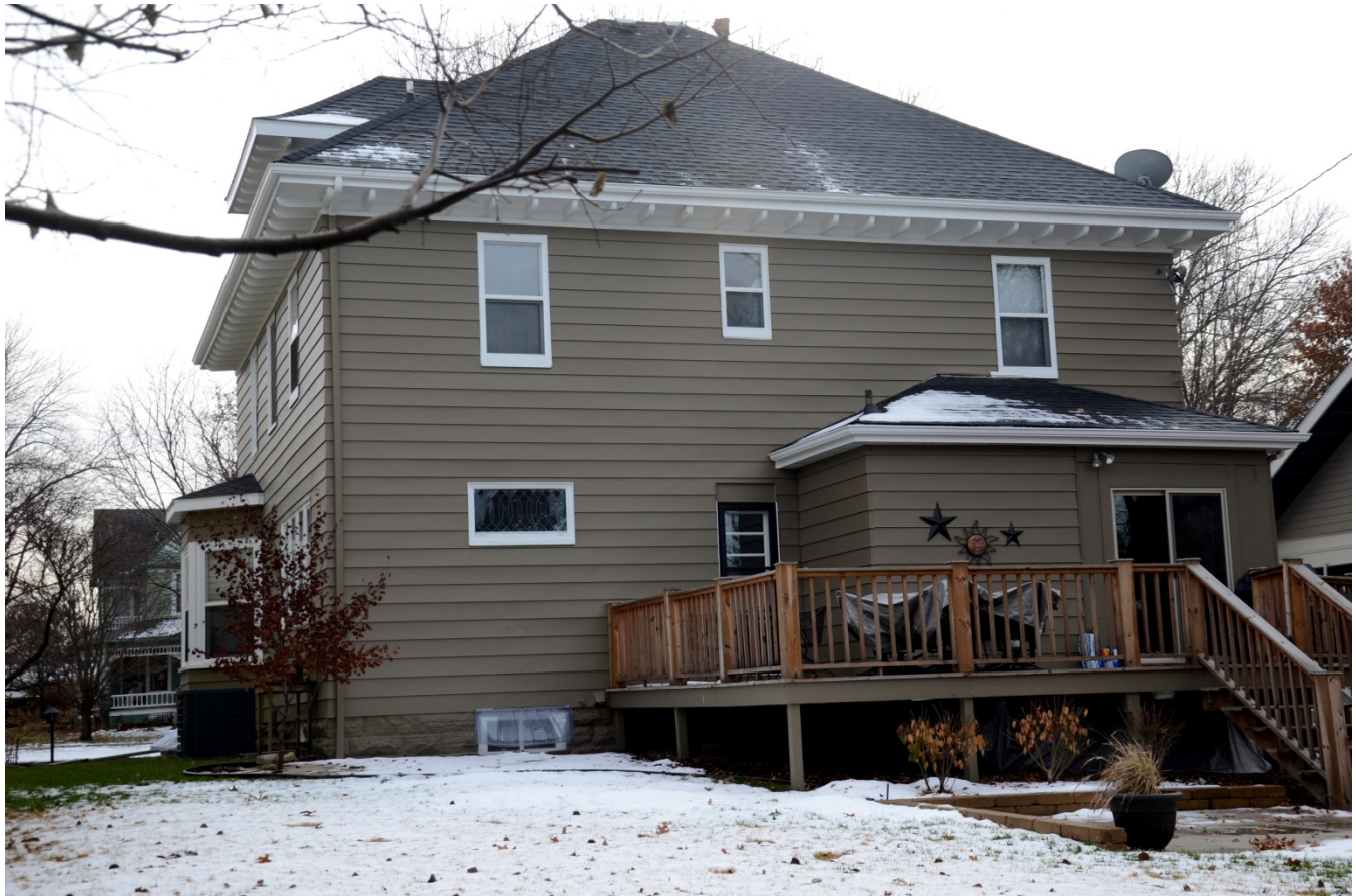
Photograph 92-00394-003 - House, looking south (December 2014)