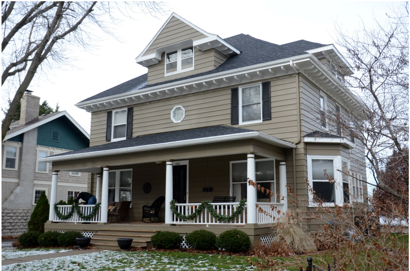
Photograph 92-00394-001 - House, looking northwest (December 2014)