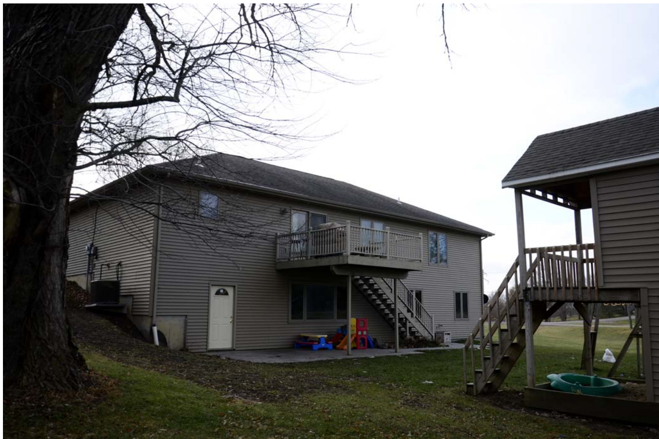
Photograph 92-00801-002 - House, looking southwest (December 2014)