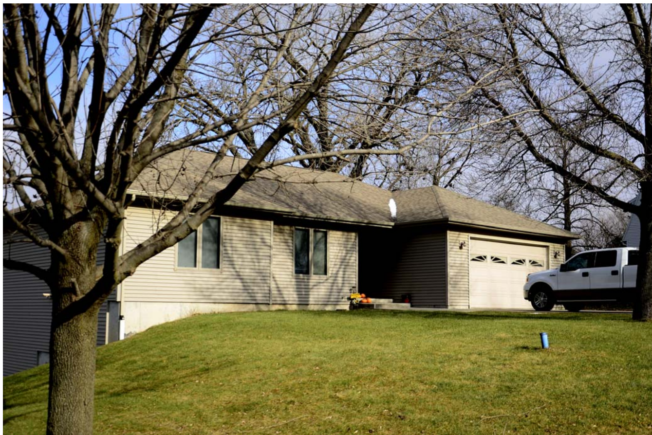
Photograph 92-00801-001 - House, looking northeast (December 2014)