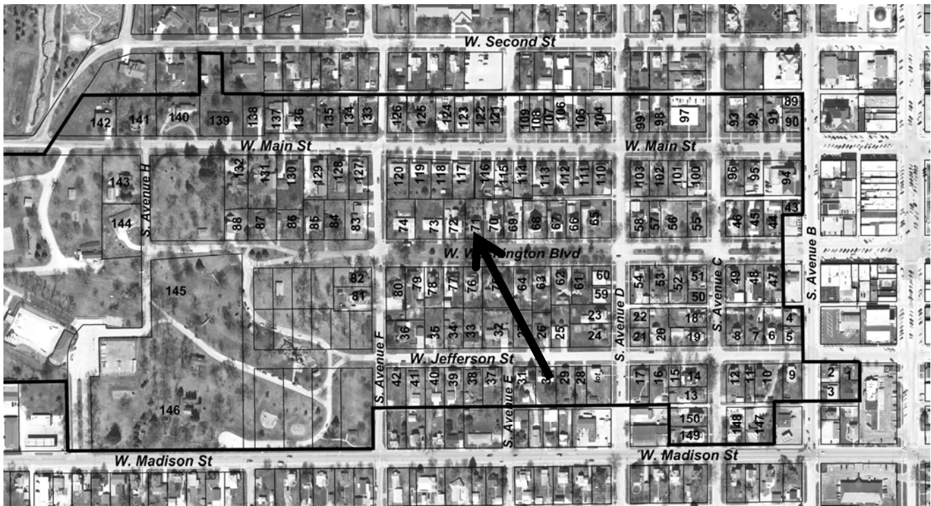
2009 aerial photograph (Washington County) – line indicates survey/research area boundary