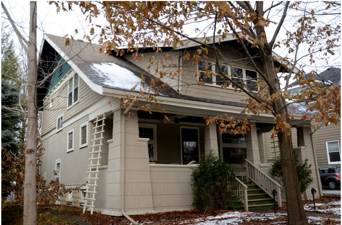
Photograph 92-00395-002 - House, looking northeast (December 2014)