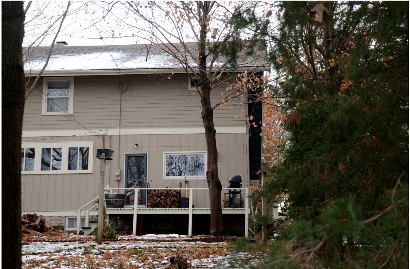
Photograph 92-00395-003 - House, looking south (December 2014)