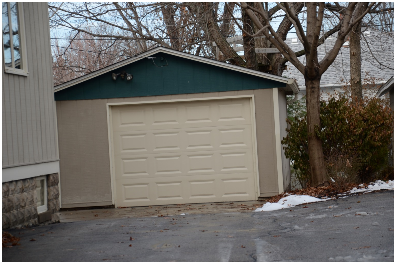
Photograph 92-00395-004 - Garage, looking north (December 2014)