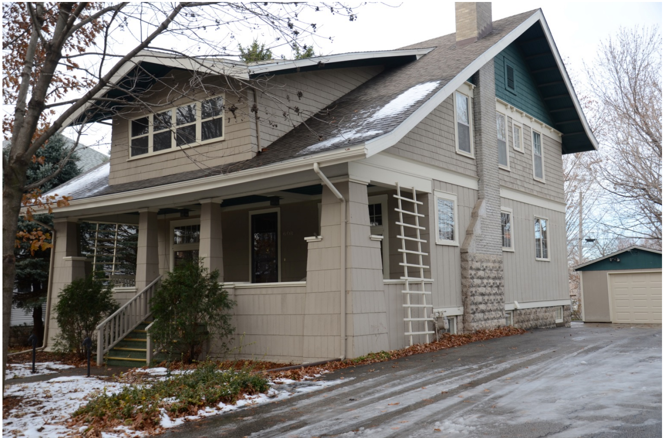
Photograph 92-00395-001 - House, looking northwest (December 2014)