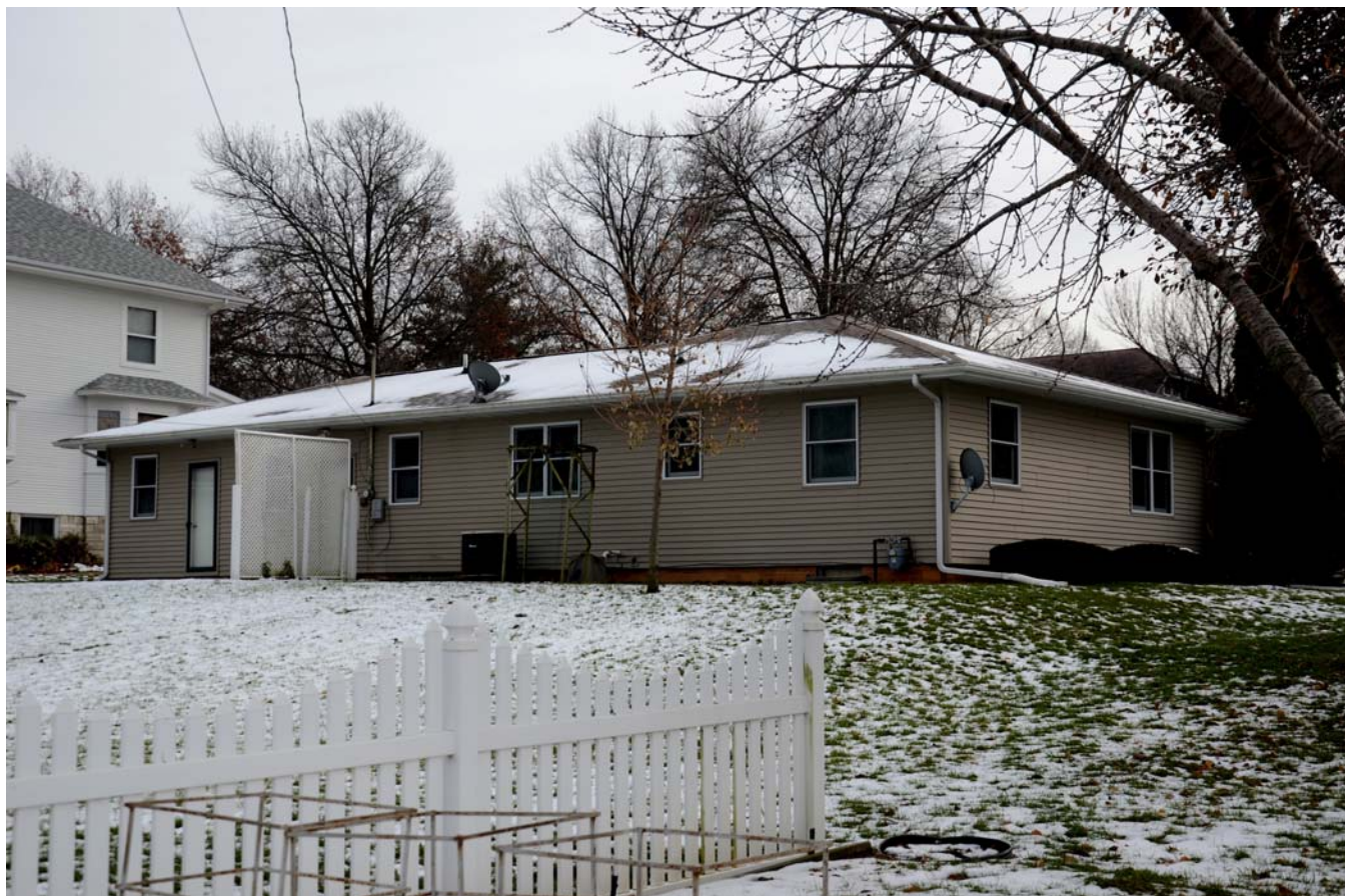
Photograph 92-00762-002 - House, looking southeast (December 2014)