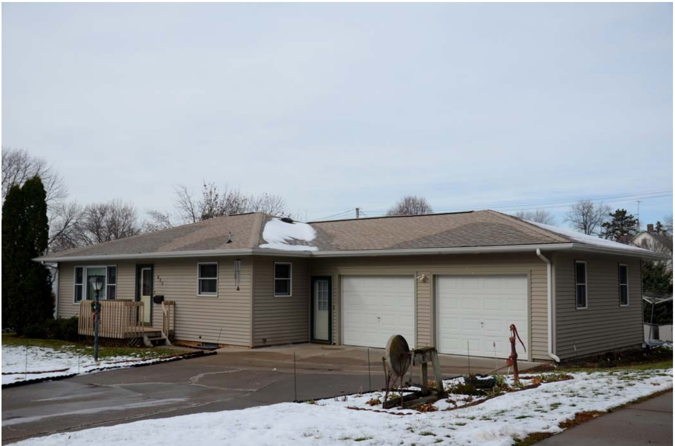
Photograph 92-00762-001 - House, looking northwest (December 2014)