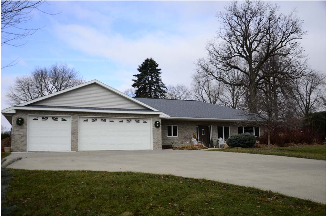
Photograph 92-00804-001 - House, looking north (December 2014)