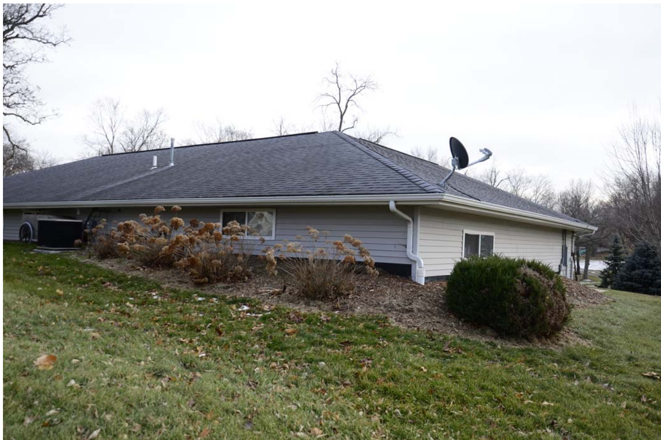
Photograph 92-00804-002 - House, looking southeast (December 2014)