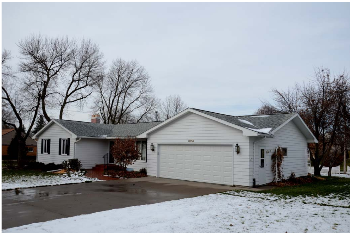
Photograph 92-00763-001 - House, looking northwest (December 2014)