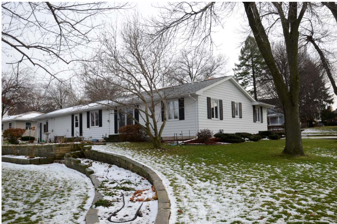
Photograph 92-00763-002 - House, looking southeast (December 2014)