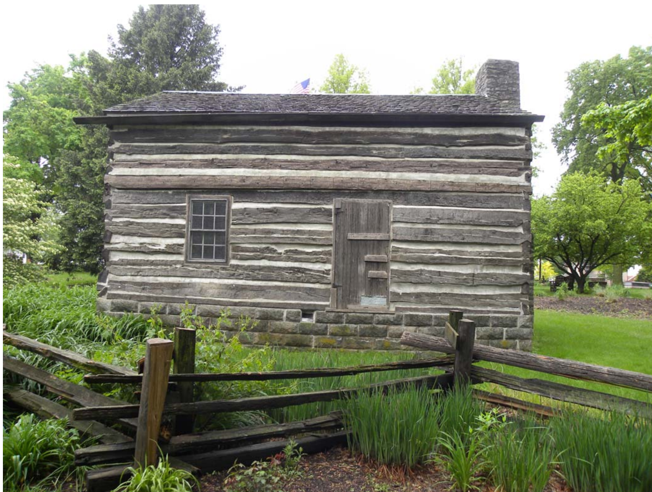
Photograph 92-00160-002 - Log House, looking south (July 2015)