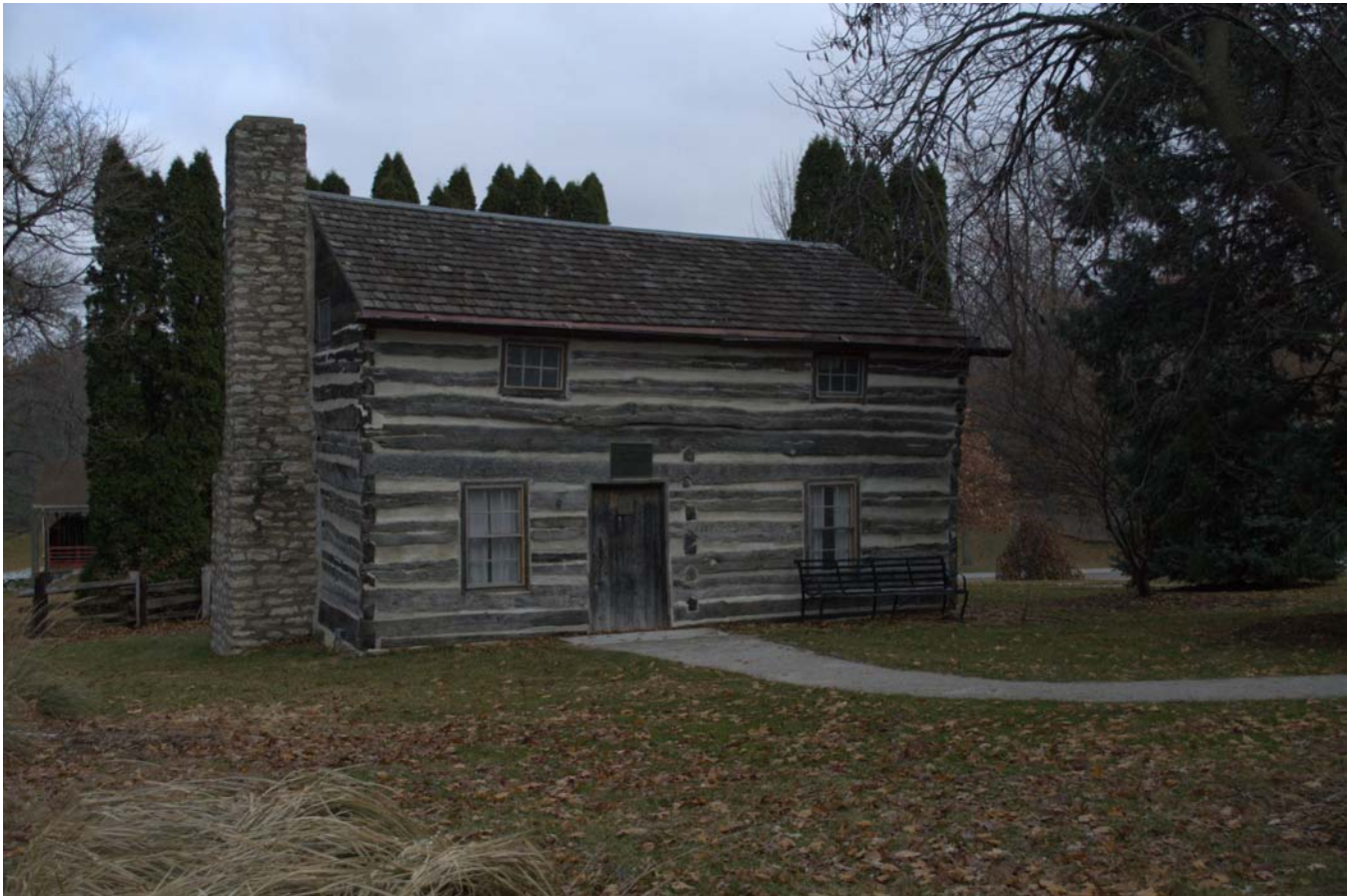
Photograph 92-00160-001 - Log House, looking northeast (December 2014)