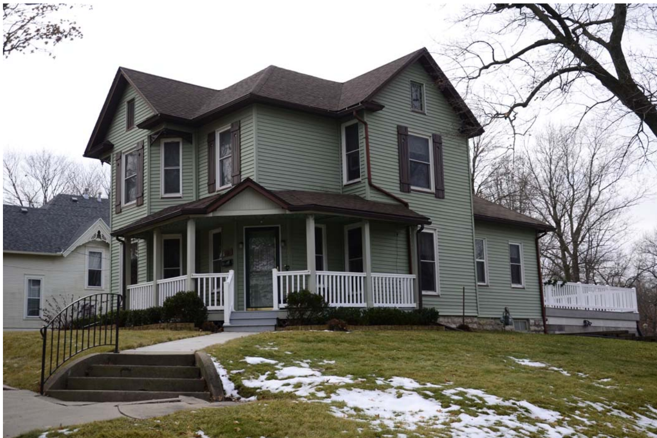
Photograph 92-00765-001 - House, looking southwest (December 2014)