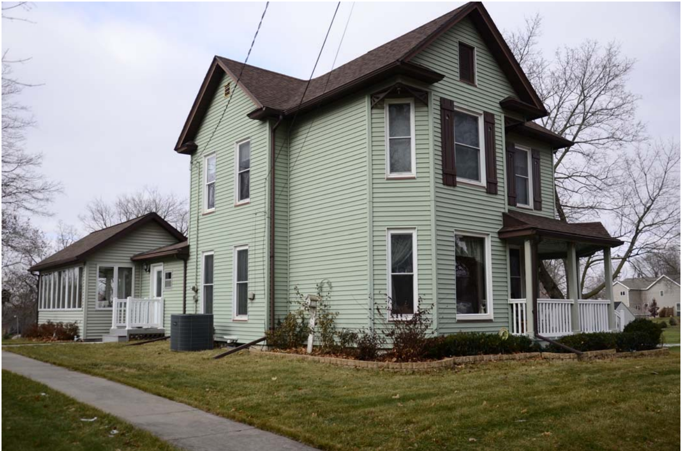
Photograph 92-00765-002 - House, looking northwest (December 2014)