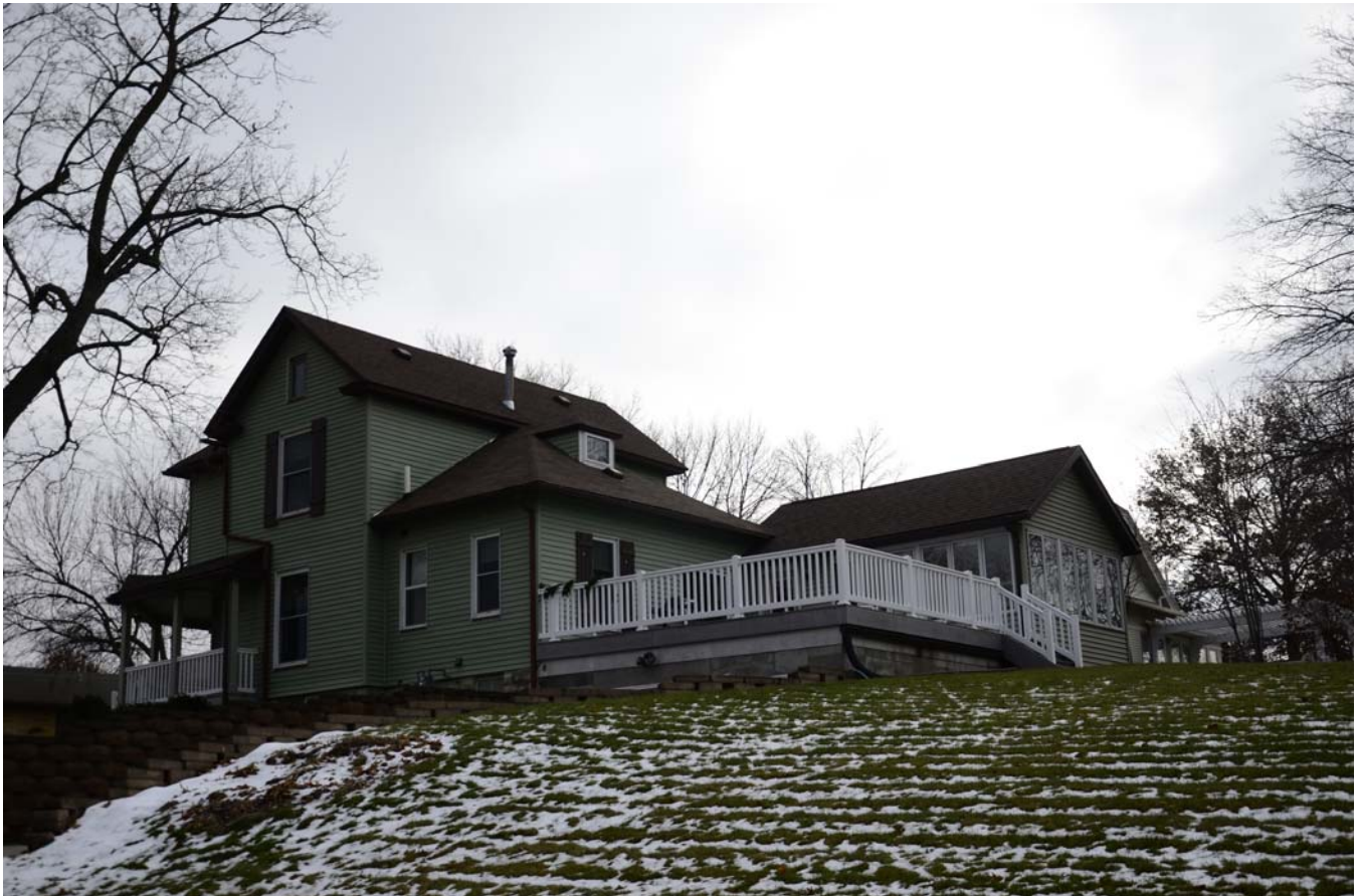
Photograph 92-00765-003 - House, looking southeast (December 2014)