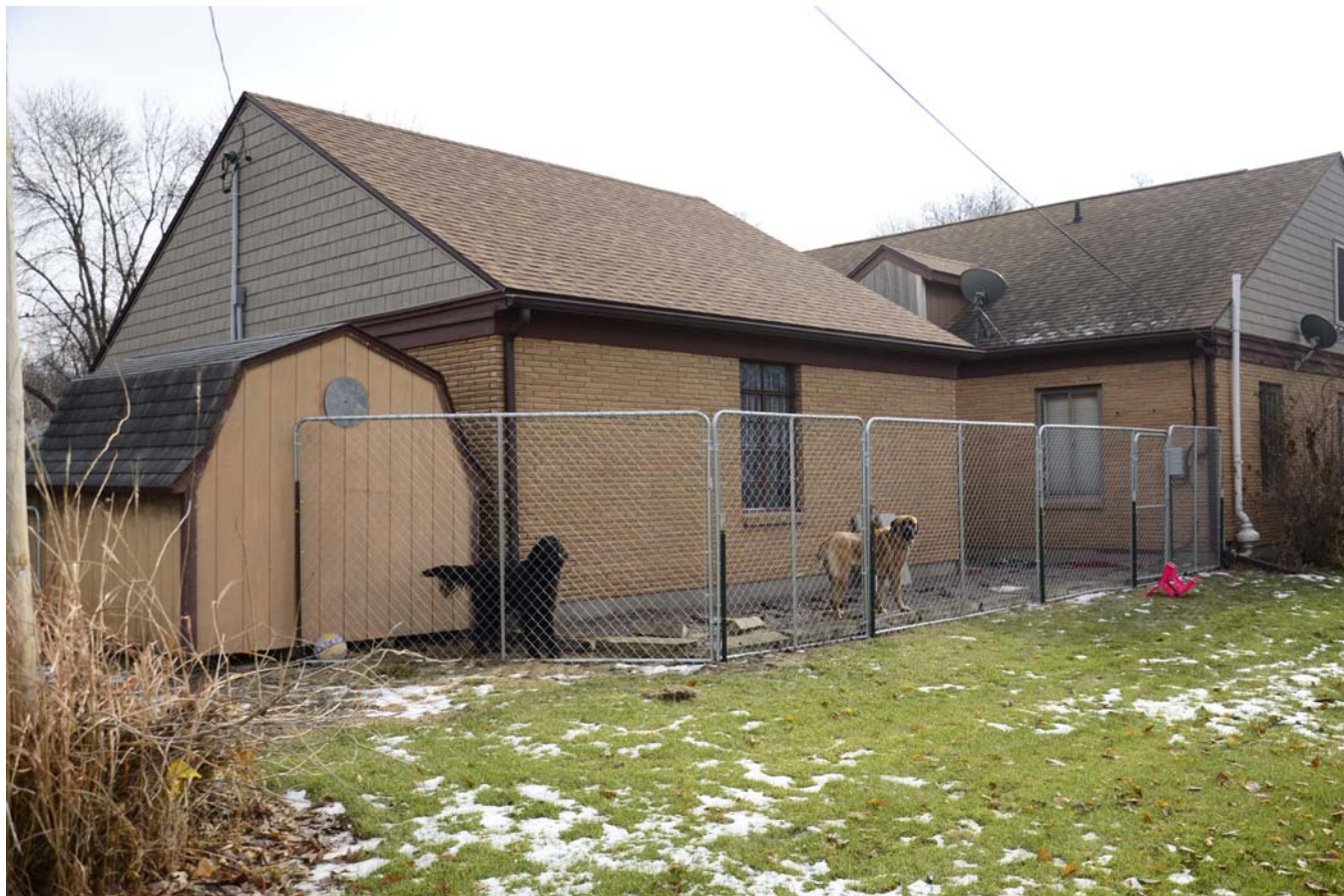
Photograph 92-00766-003 - House, looking southeast (December 2014)