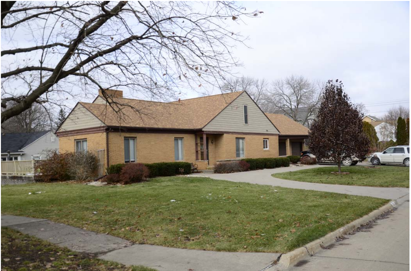
Photograph 92-00766-001 - House, looking northwest (December 2014)