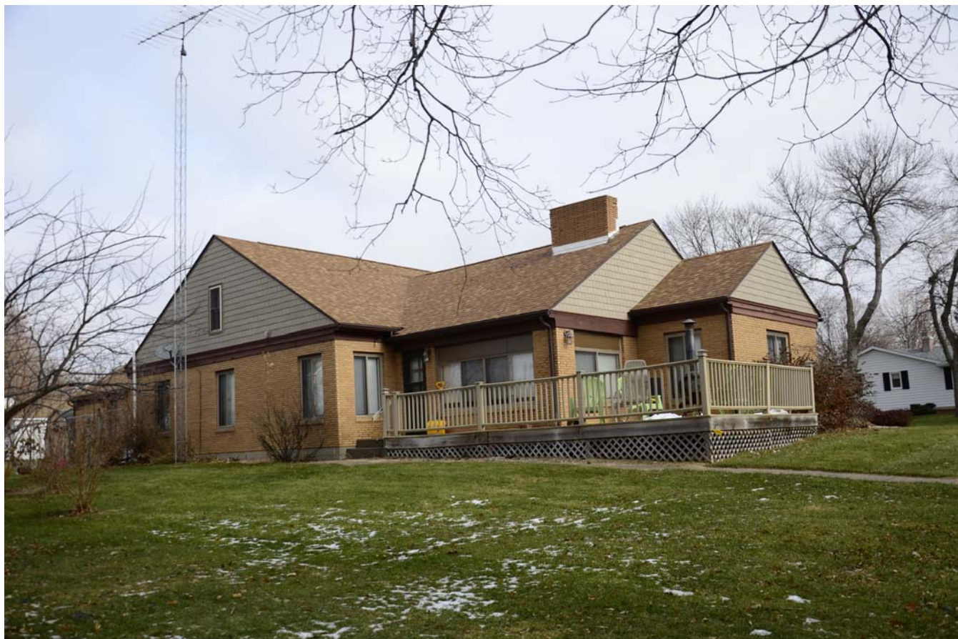
Photograph 92-00766-002 - House, looking northeast (December 2014)