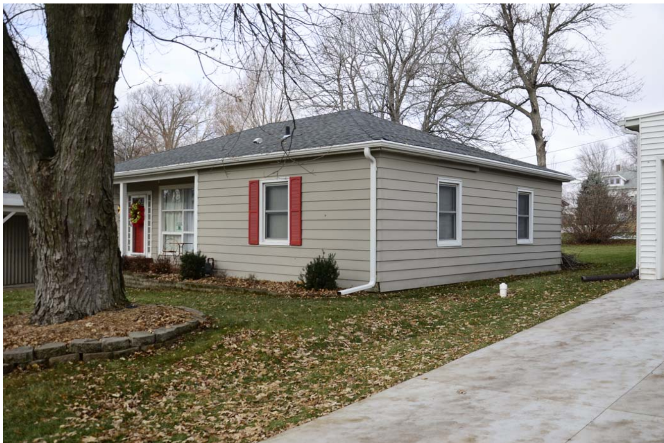
Photograph 92-00768-002 - House, looking northwest (December 2014)