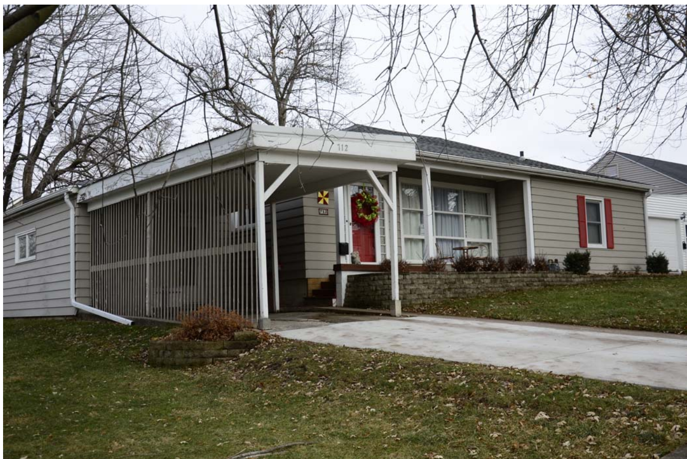
Photograph 92-00768-001 - House, looking northeast (December 2014)