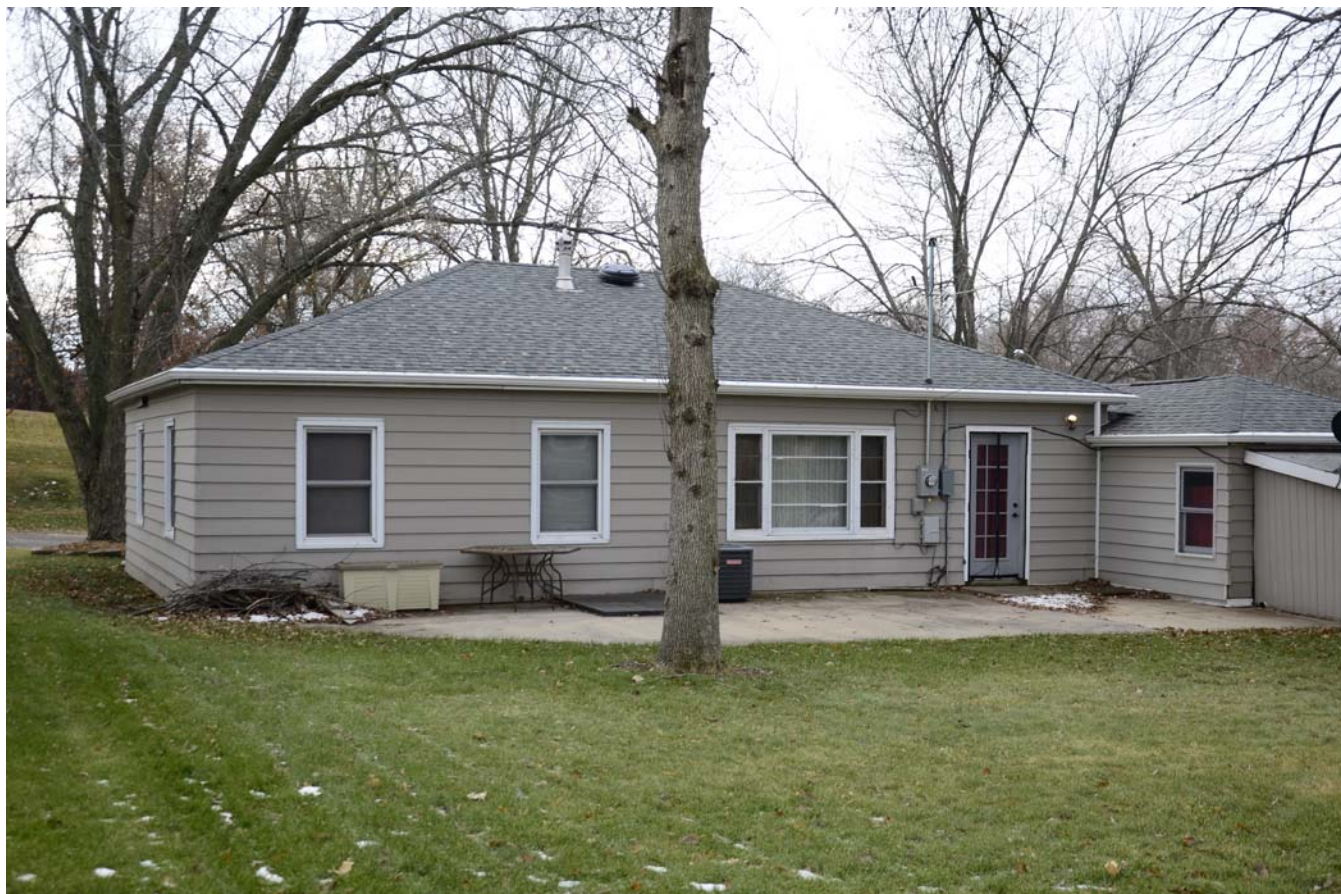
Photograph 92-00768-003 - House, looking south (December 2014)