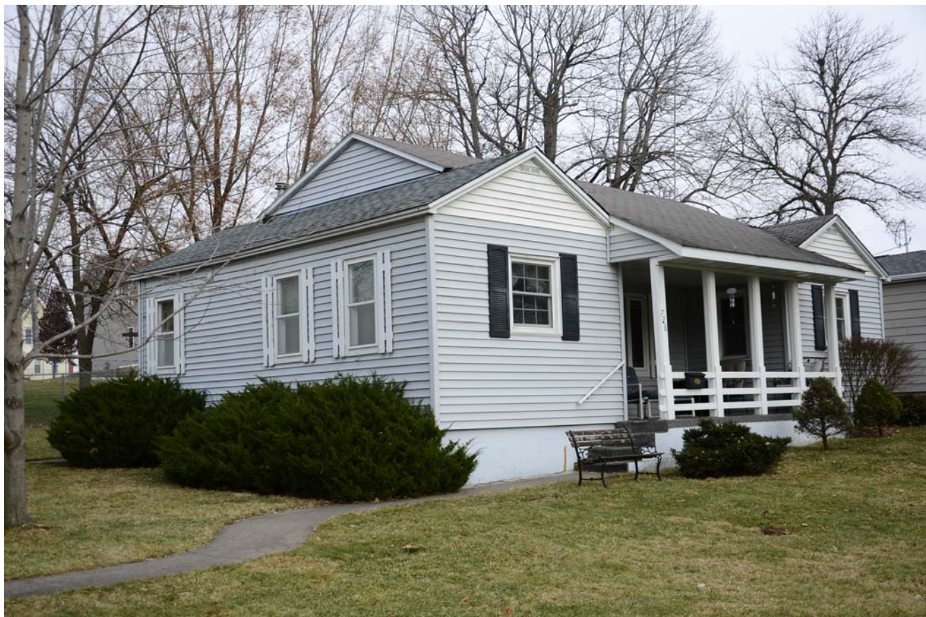
Photograph 92-00769-002 - House, looking northeast (December 2014)