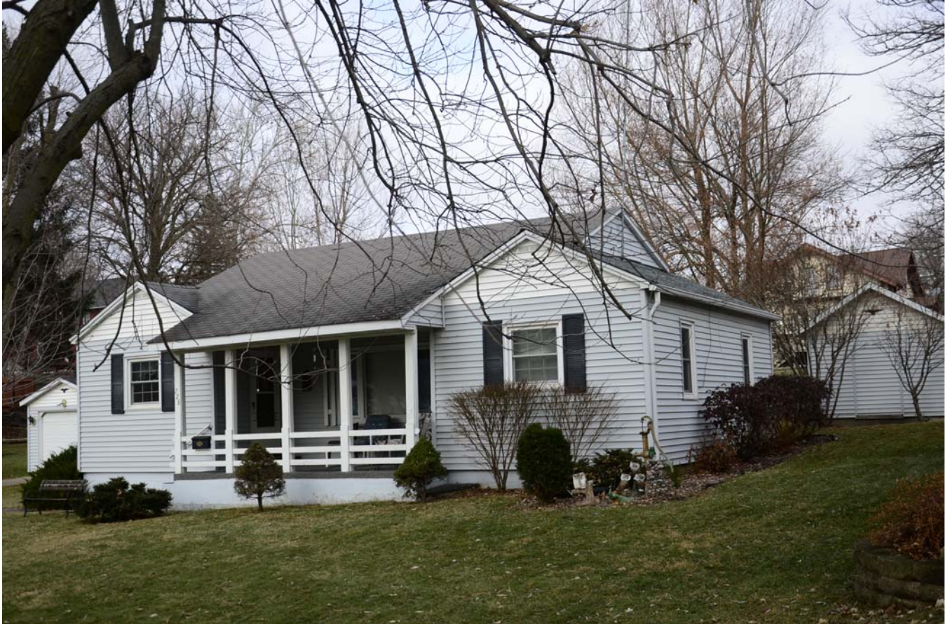
Photograph 92-00769-001 - House, looking northwest (December 2014)