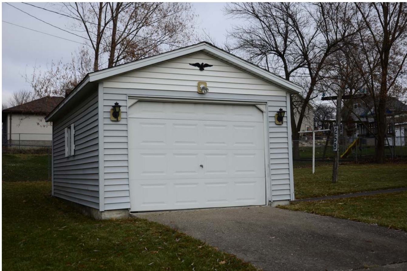
Photograph 92-00769-004 - Garage, looking northeast (December 2014)