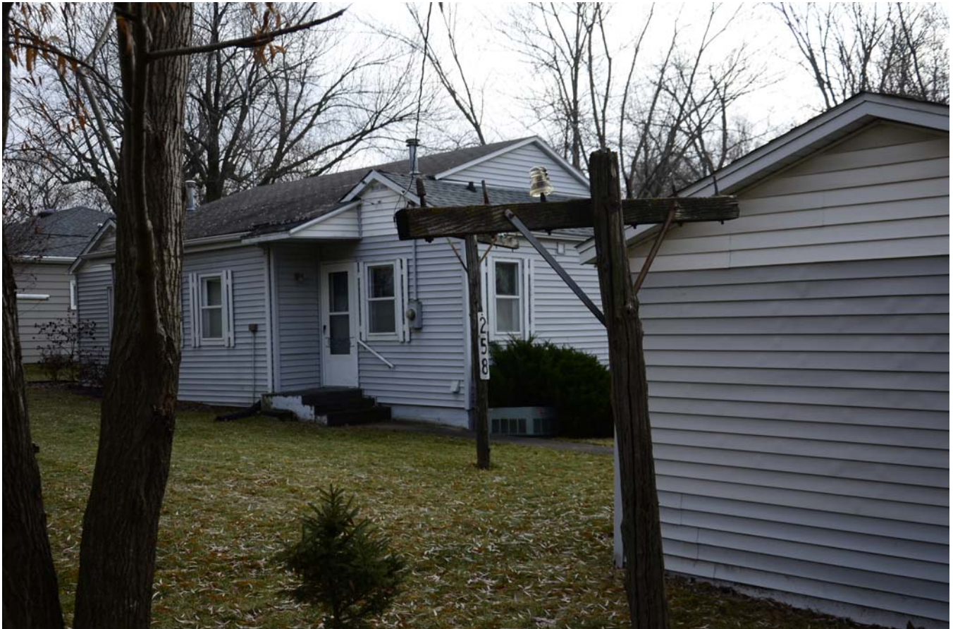
Photograph 92-00769-003 - House, looking southeast (December 2014)