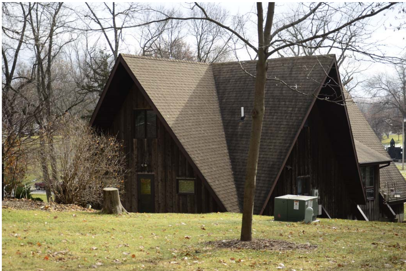
Photograph 92-00771-002 - House, looking southeast (December 2014)