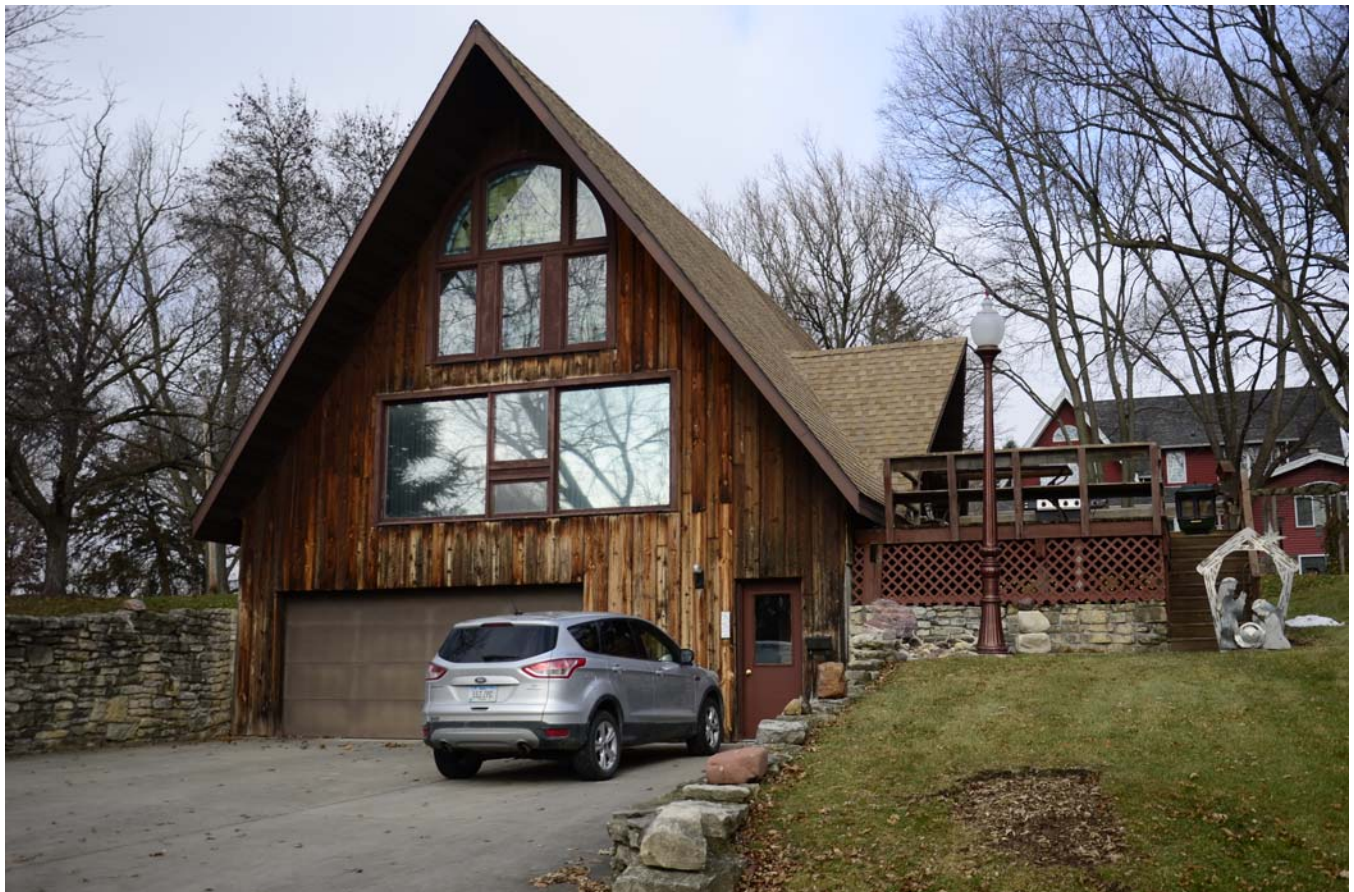
Photograph 92-00771-001 - House, looking northwest (December 2014)