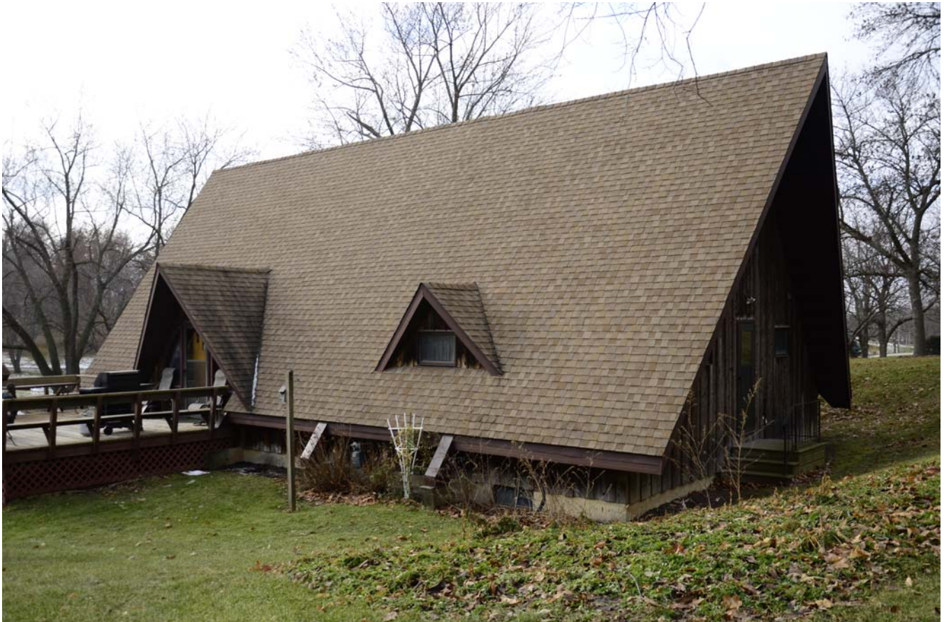
Photograph 92-00771-003 - House, looking southwest (December 2014)