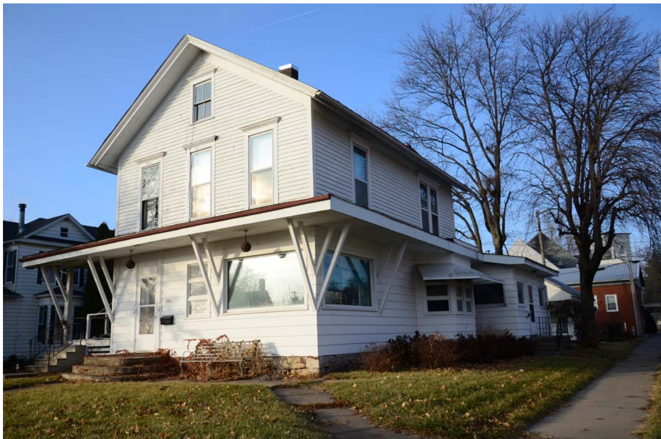
Photograph 92-00773-002 - House, looking northwest (December 2014)