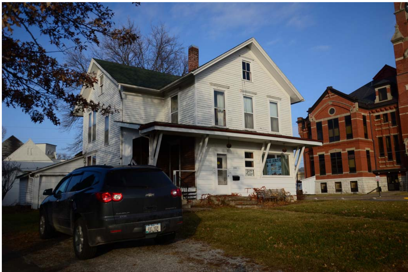
Photograph 92-00773-001 - House, looking northeast (December 2014)