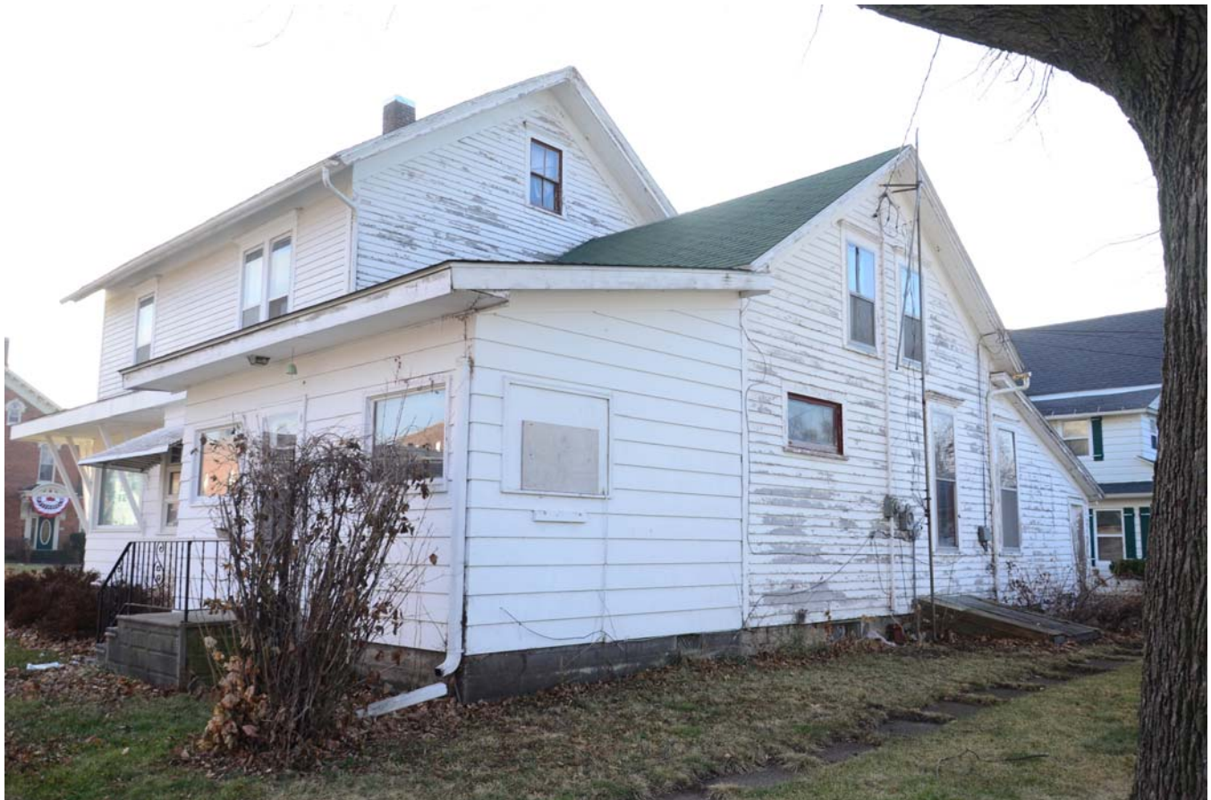
Photograph 92-00773-003 - House, looking southwest (December 2014)