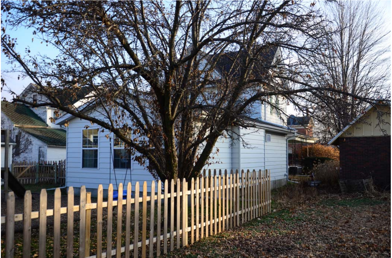
Photograph 92-00411-005 - House, looking southeast (December 2014)