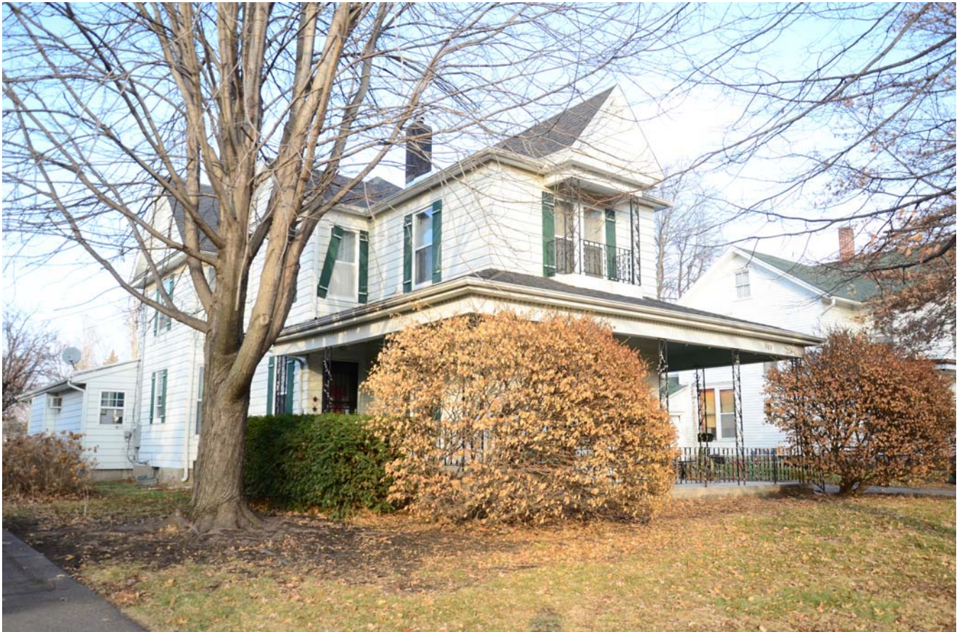
Photograph 92-00411-002 - House, looking northeast (December 2014)