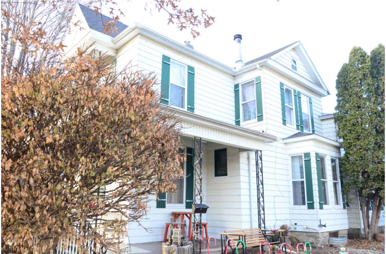
Photograph 92-00411-003 - House, looking northwest (December 2014)