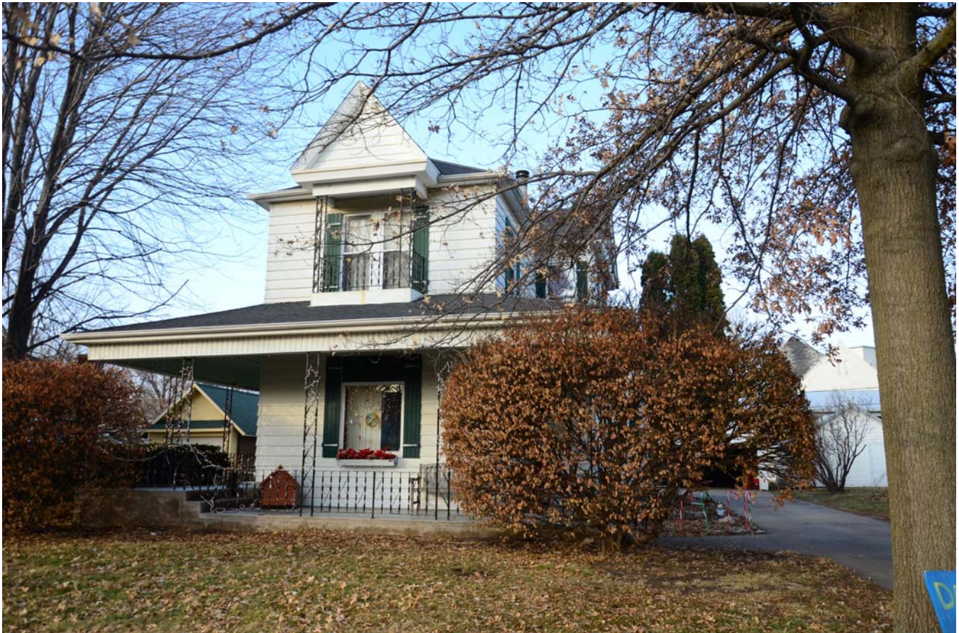
Photograph 92-00411-001 - House, looking northwest (December 2014)