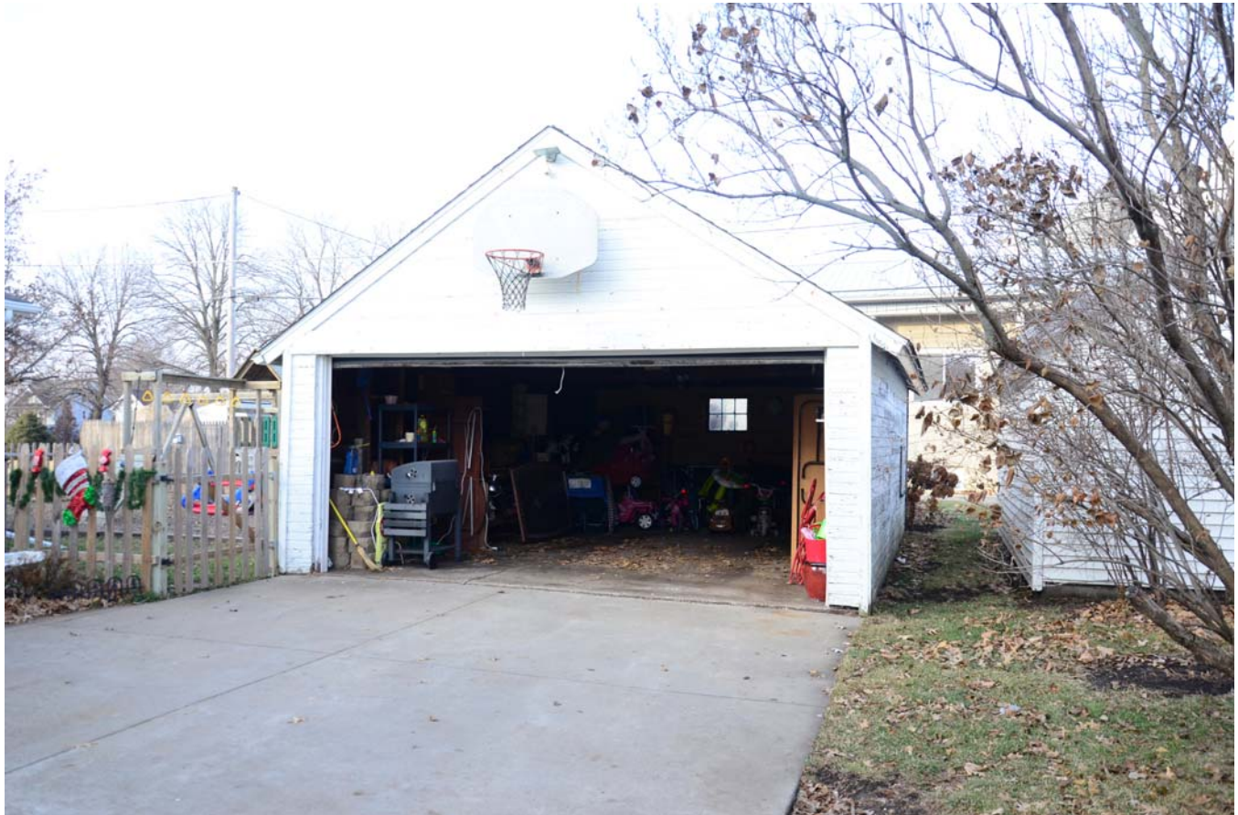
Photograph 92-00411-006 - Garage, looking northwest (December 2014)