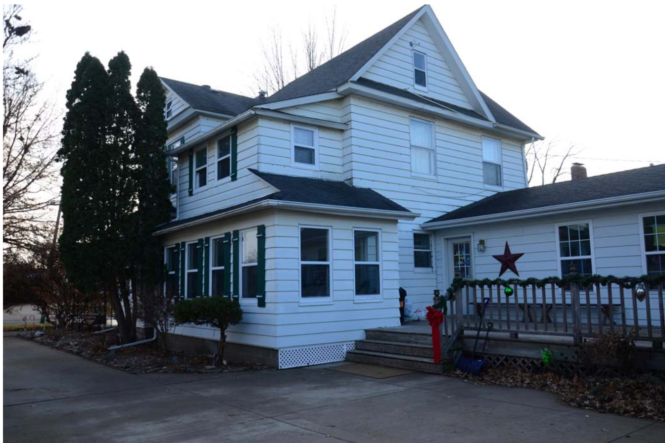
Photograph 92-00411-004 - House, looking southwest (December 2014)