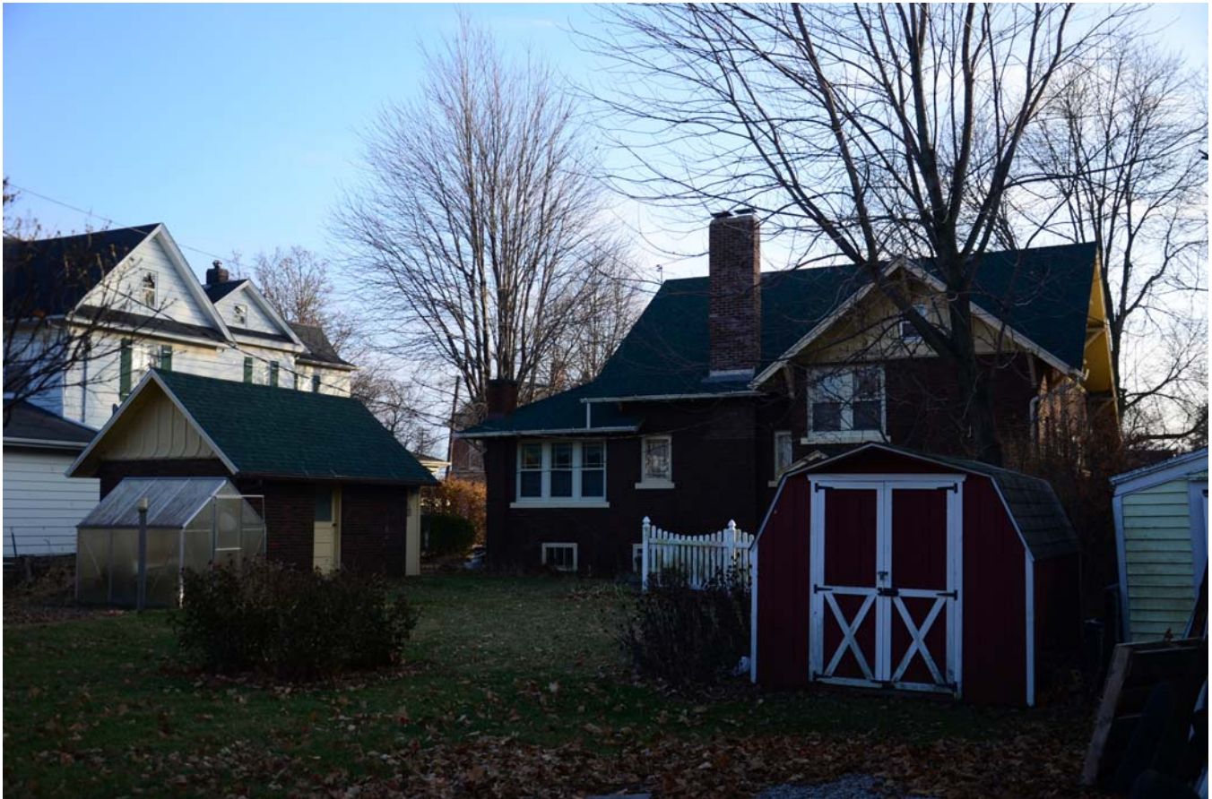
Photograph 92-00412-003 - House, looking northeast (December 2014)