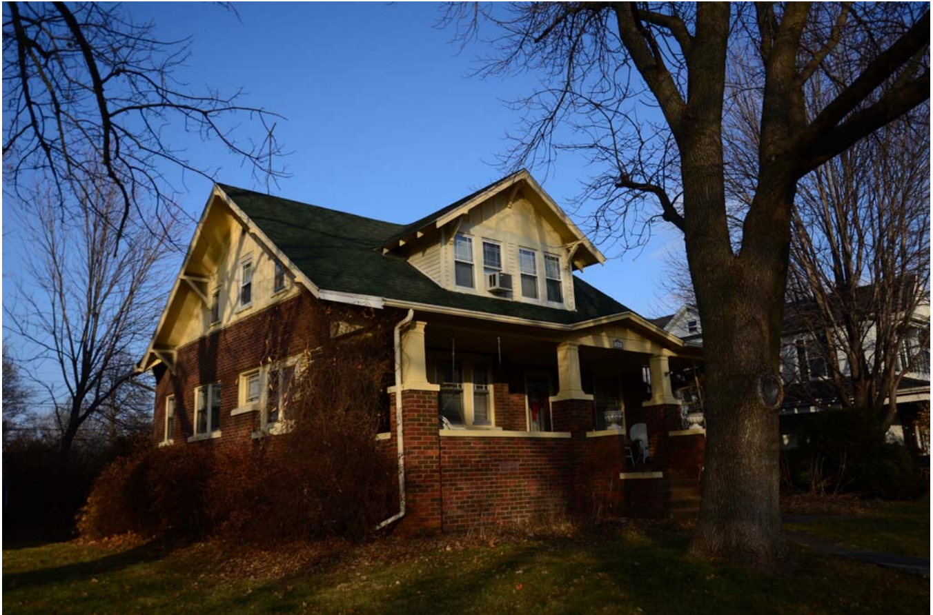
Photograph 92-00412-001 - House, looking northeast (December 2014)