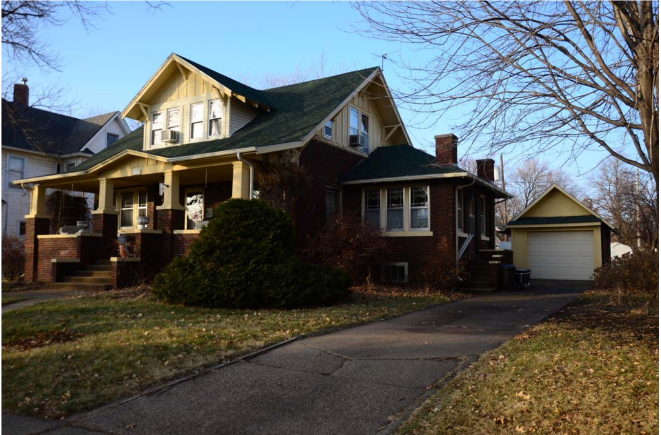
Photograph 92-00412-002 - House, looking northeast (December 2014)