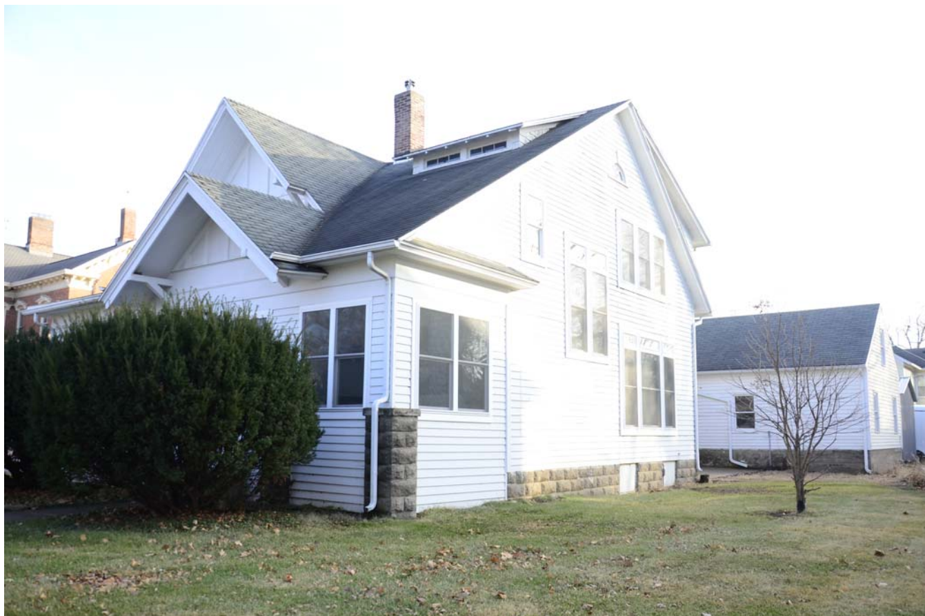
Photograph 92-00398-003 - House, looking southeast (December 2014)