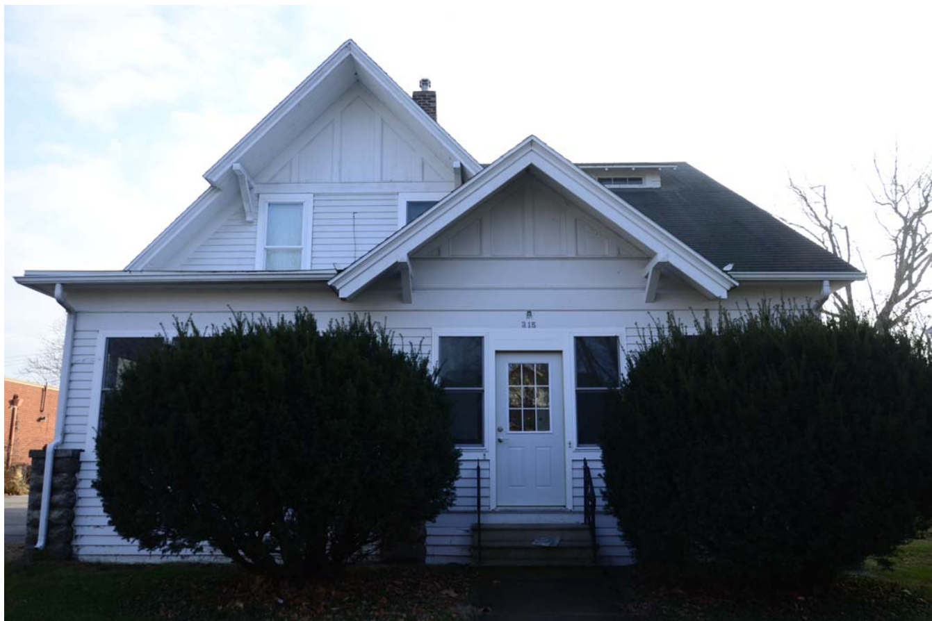
Photograph 92-00398-001 - House, looking south (December 2014)