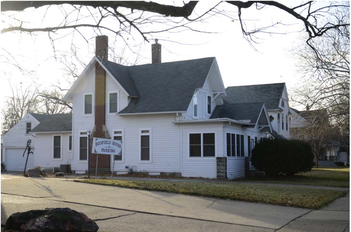
Photograph 92-00398-002 - House, looking southwest (December 2014)