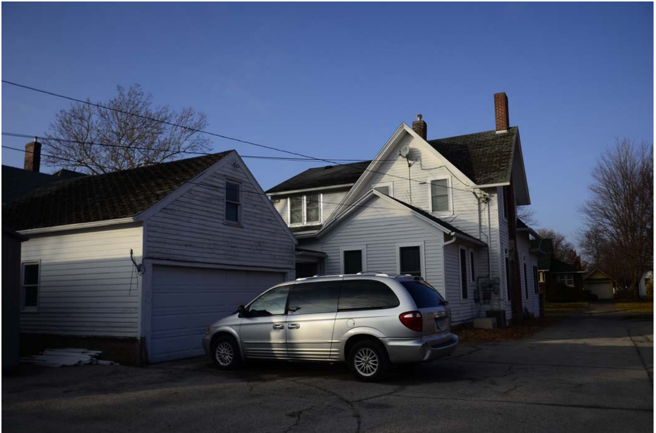
Photograph 92-00398-004 - House and garage, looking northwest (December 2014)