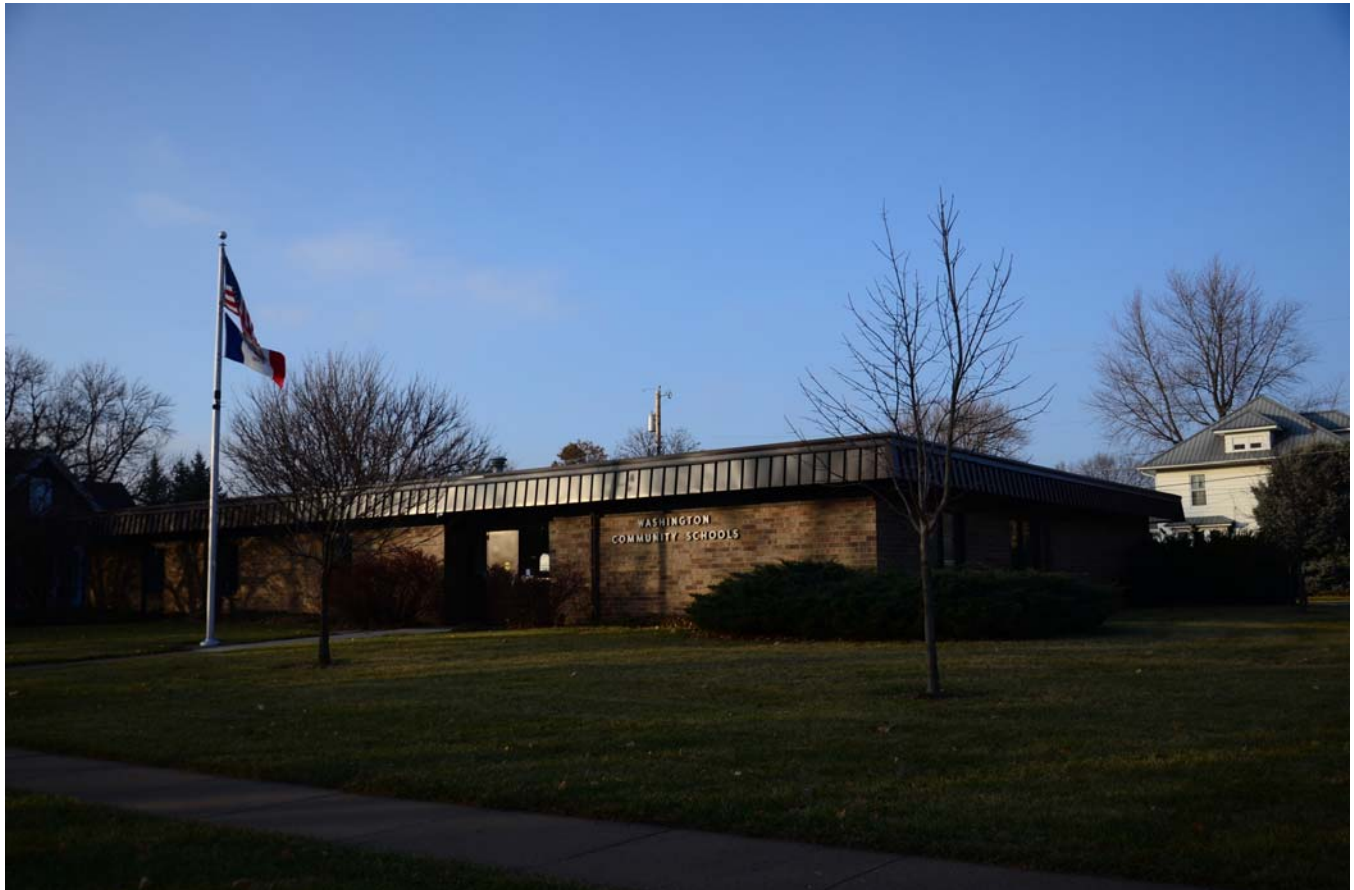
Photograph 92-00774-001 - Building, looking northwest (December 2014)