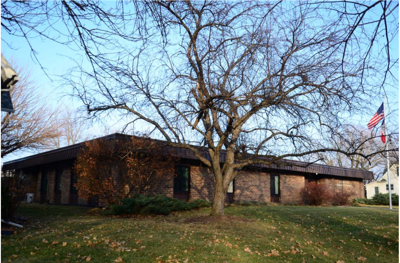
Photograph 92-00774-002 - Building, looking northeast (December 2014)