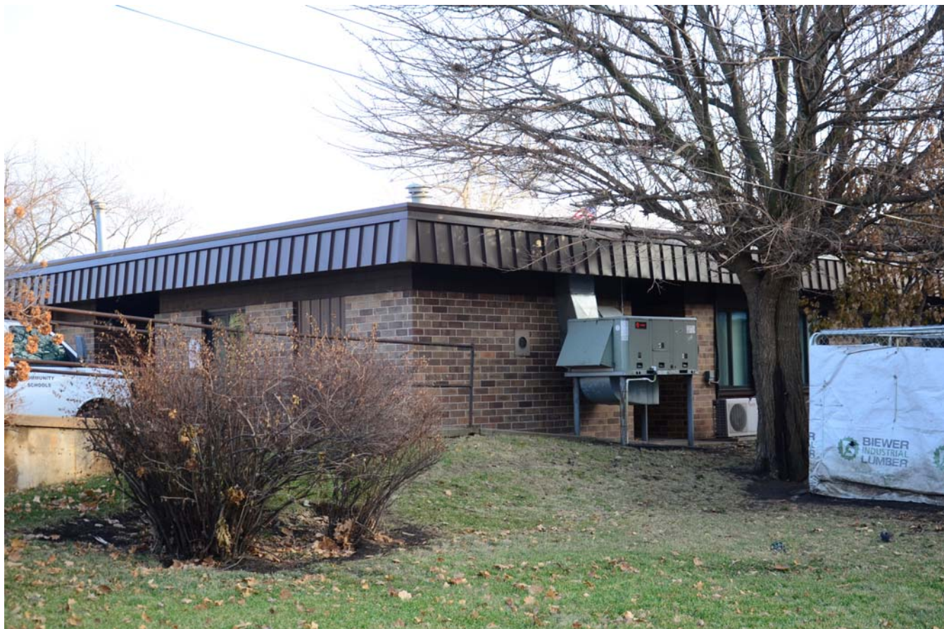
Photograph 92-00774-003 - Building, looking southwest (December 2014)