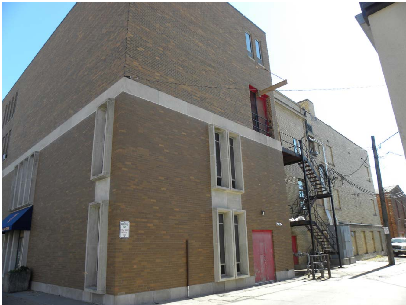
Photograph 92-00537-003 - West elevation, looking southeast.