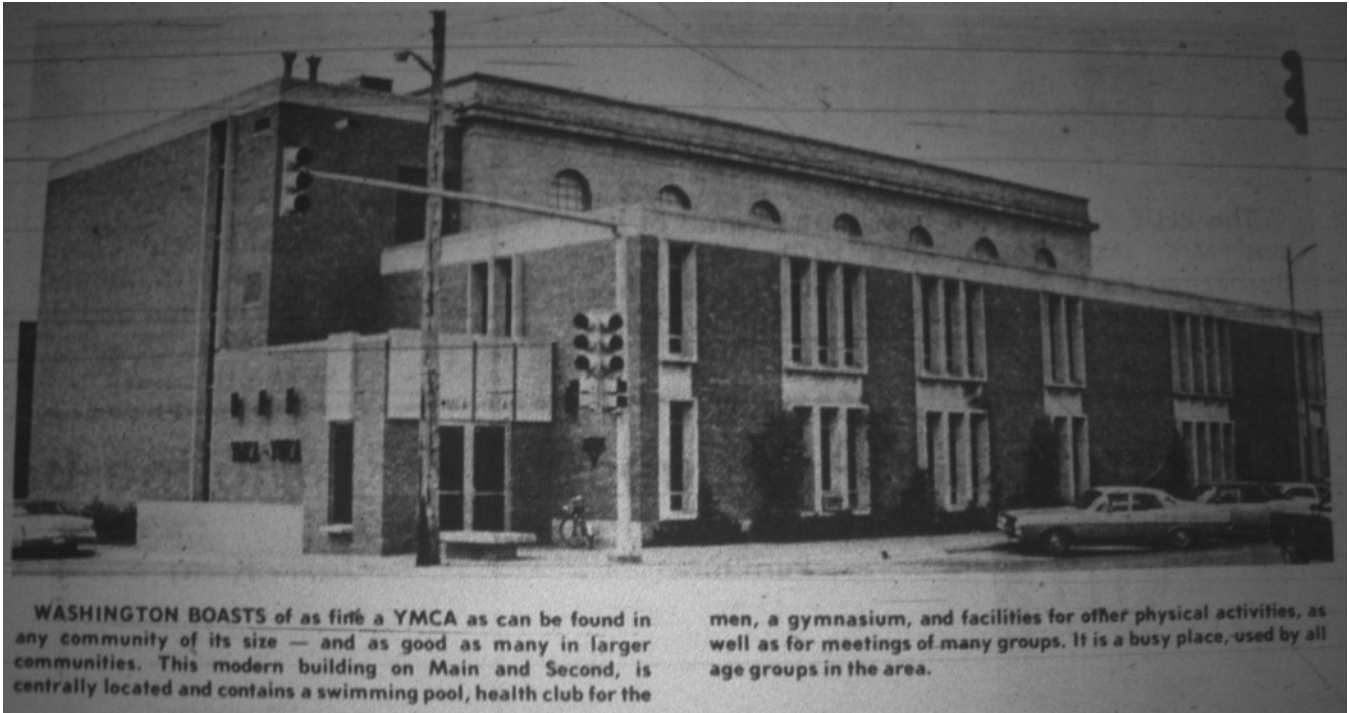
YMCA after 1966 front addition and 1973 side additions ( Evening Journal , July 1, 1976, 54)