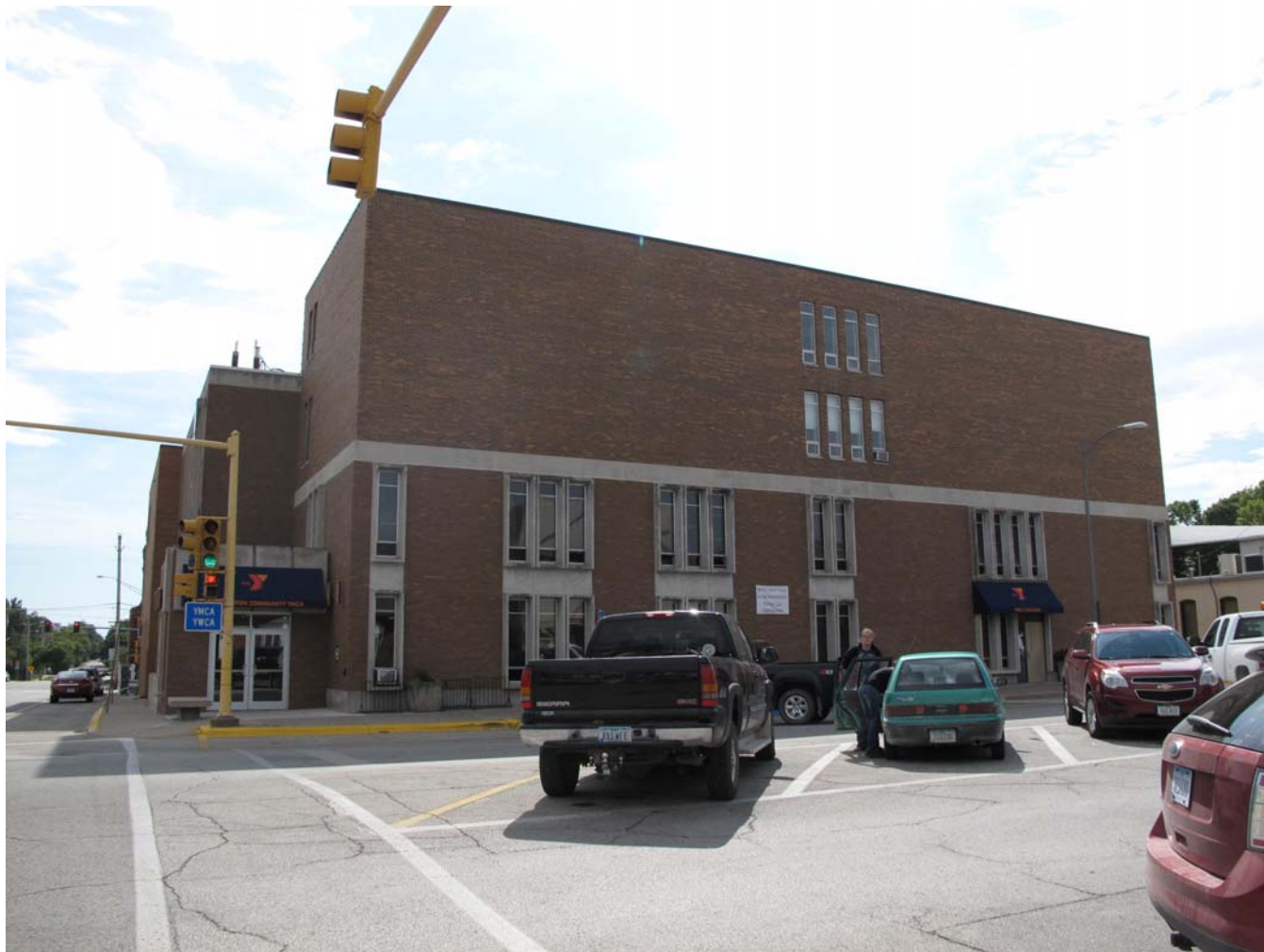
Photograph 92-00537-002 - North elevation, looking south.