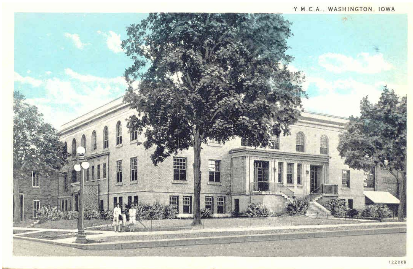
Original 1925 building