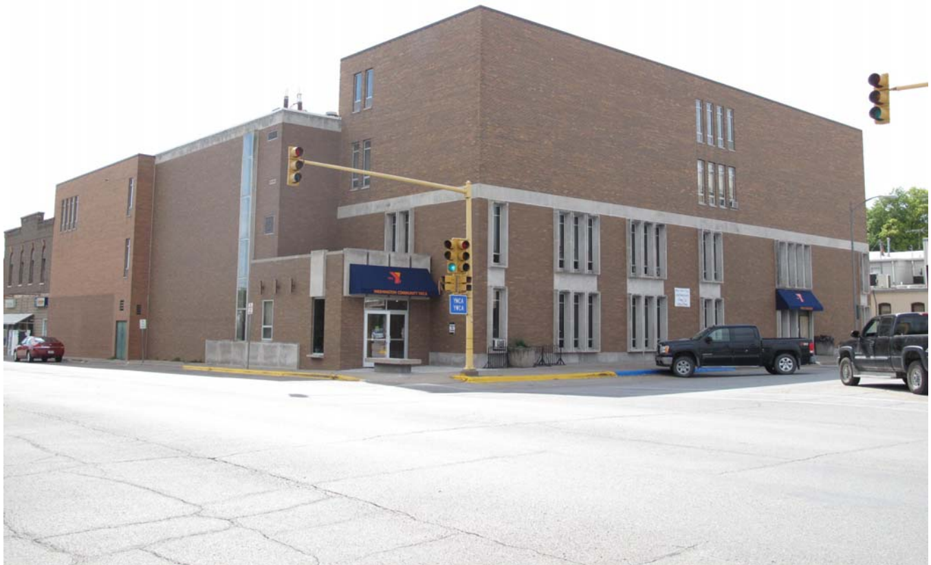
Photograph 92-00537-001 - East and north elevations, looking southwest.