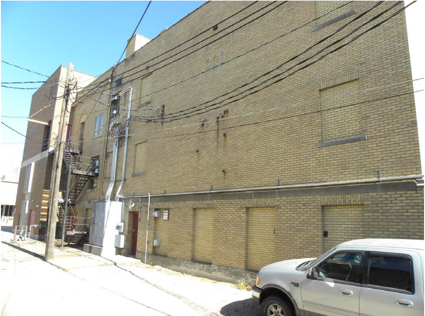
Photograph 92-00537-004 - West elevation, looking northeast.