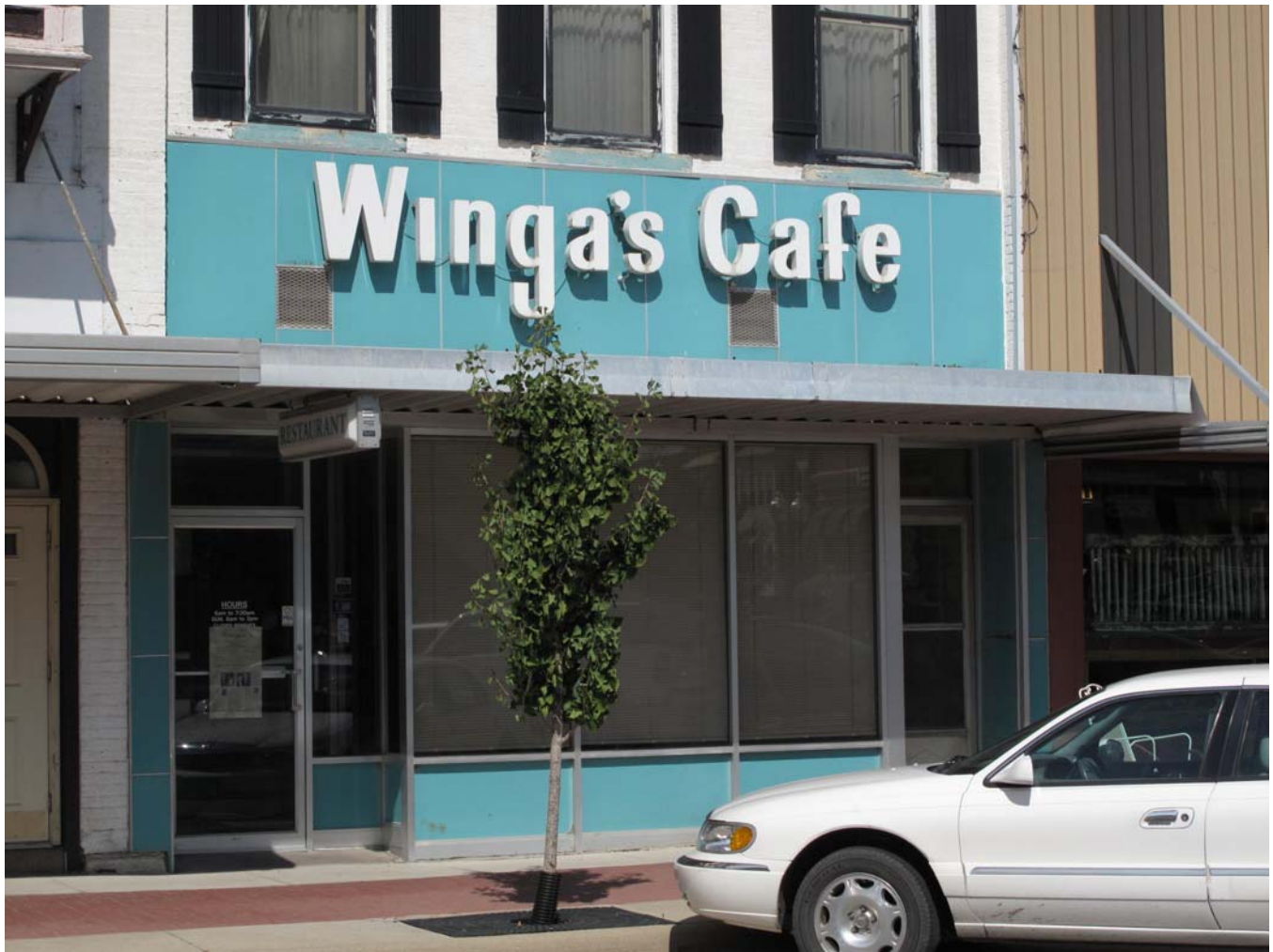
Photograph 92-00539-002 - Detail of storefront, looking north-northeast.