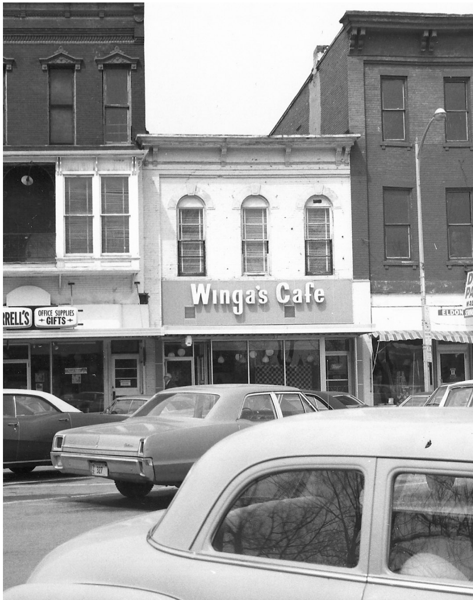
Building in 1971 (Wagner 1971).