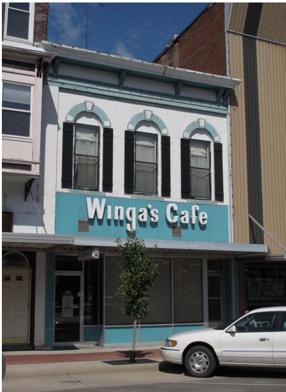
Photograph 92-00539-001 - South elevation, looking northeast.