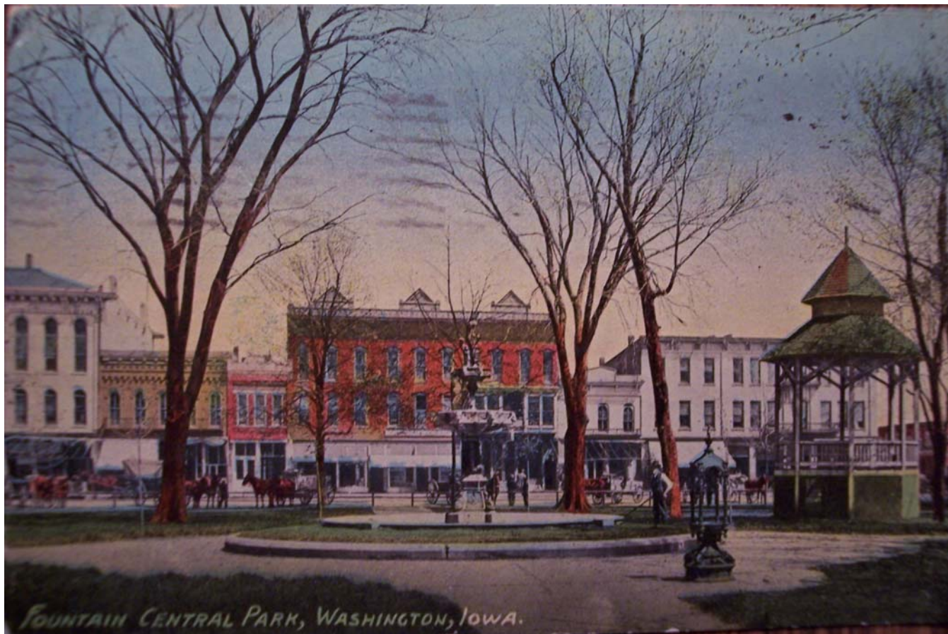
North side of square in early 1900s