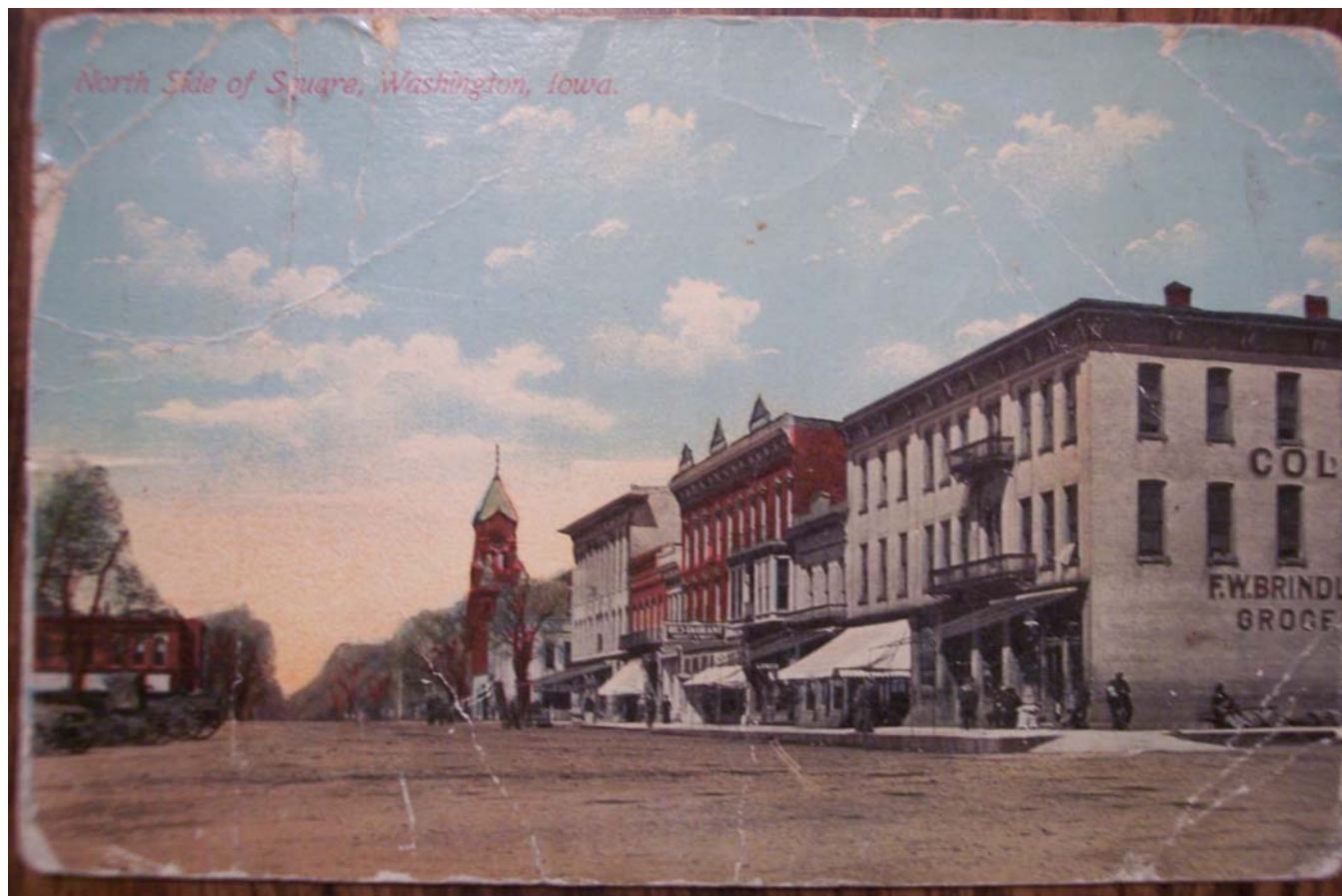
North side of square in early 1900s.