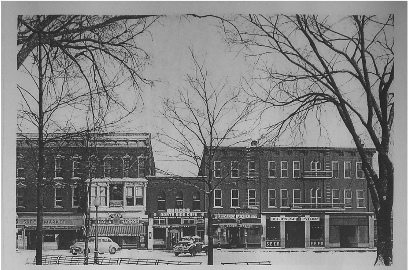
North side of square in late 1930s