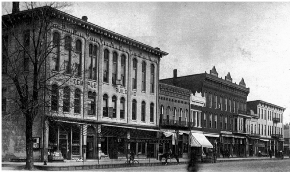
155' N. side of Square, Washington, Ia.

International Stereograph Co., Decatur, Ill.