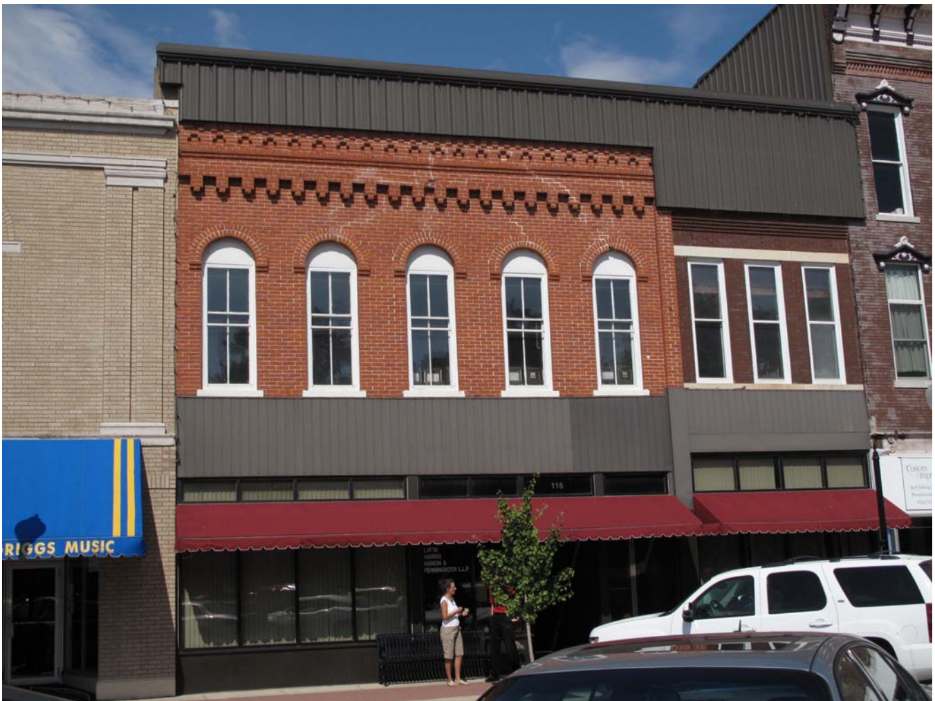
Photograph 92-00542-001 - South elevation, looking north