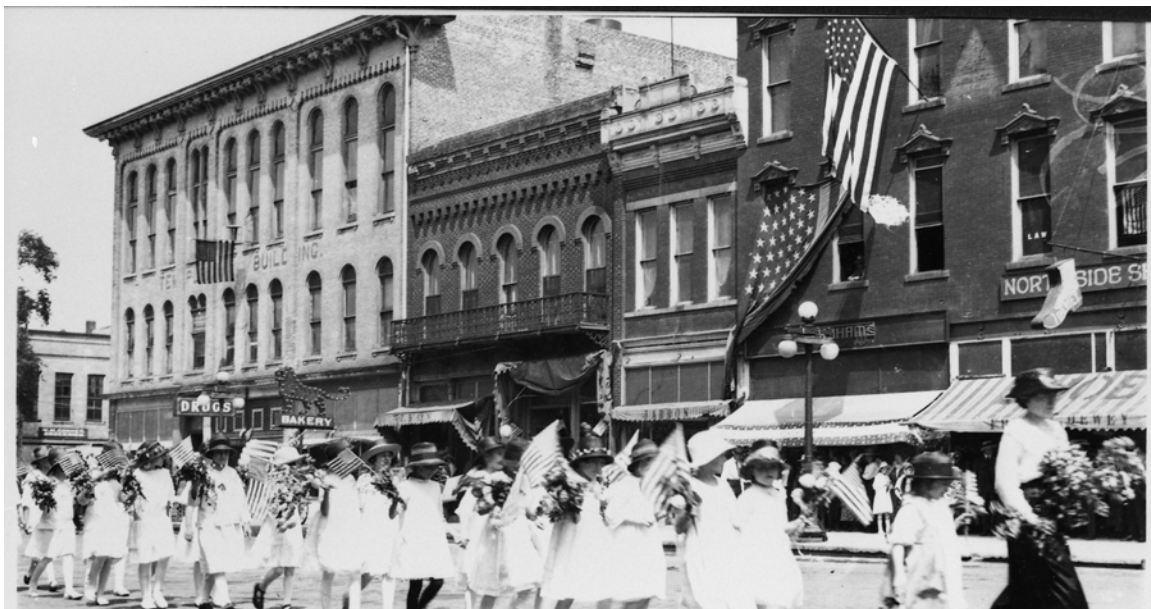
North side of square around 1918 (Patterson collection).