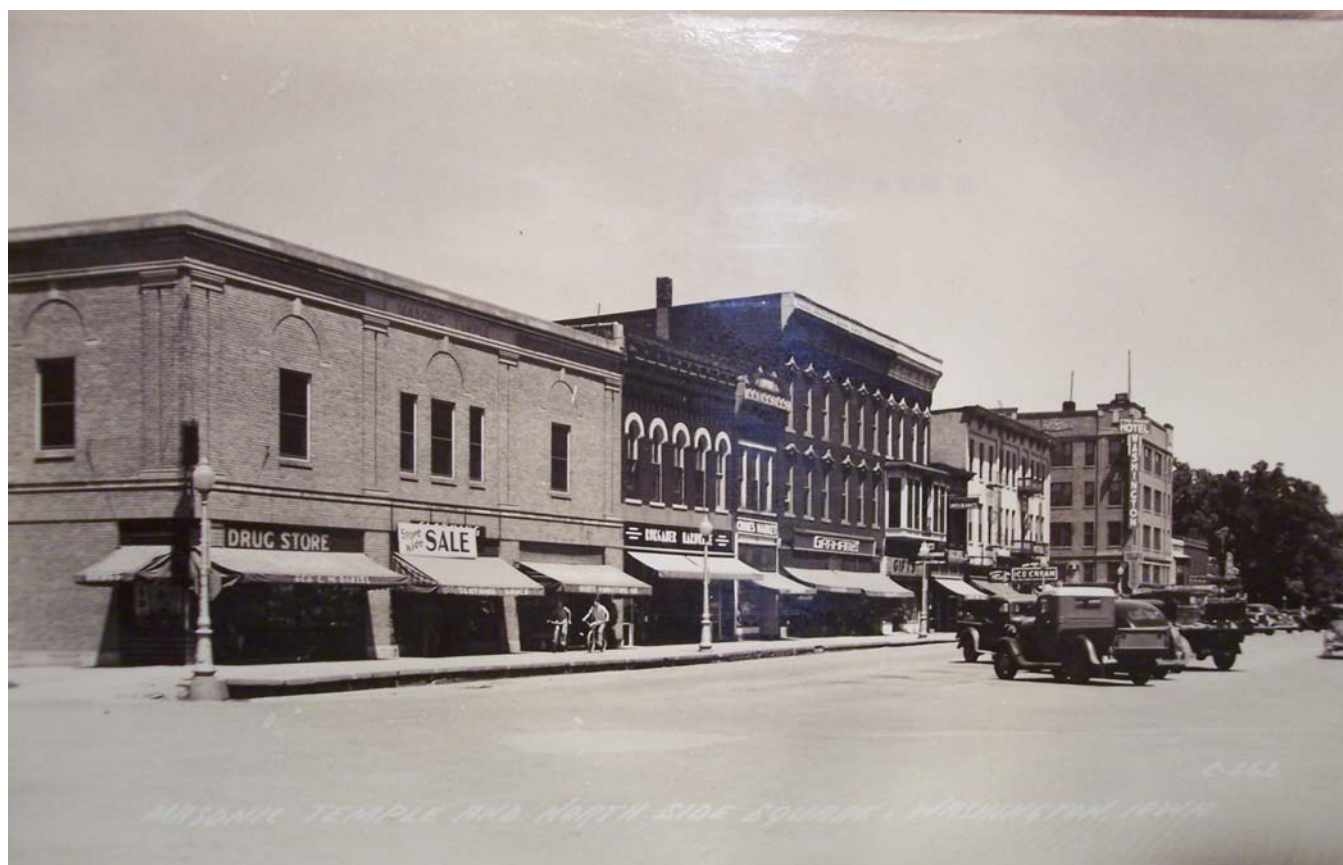
North side of the square in the 1940s.