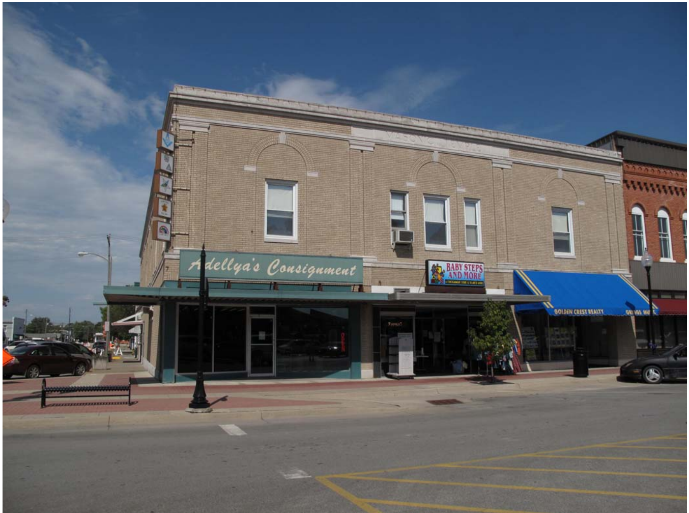
Photograph 92-00543-002 - South elevation, looking north