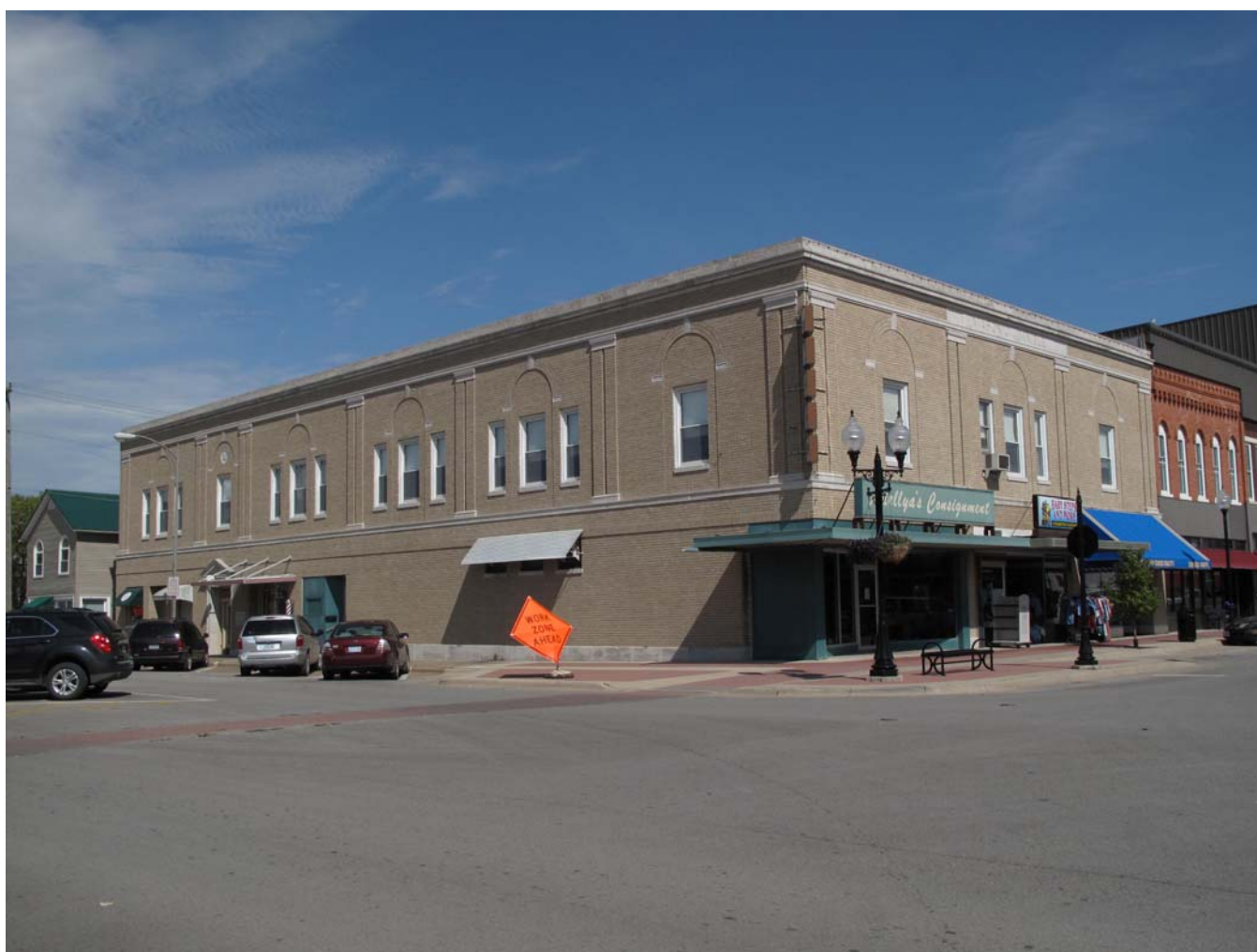
Photograph 92-00543-001 - West and south elevations, looking northeast (, September 20, 2011)