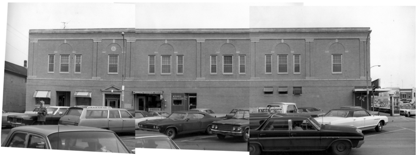
Collage of 1971 photographs of building (Wagner 1971)