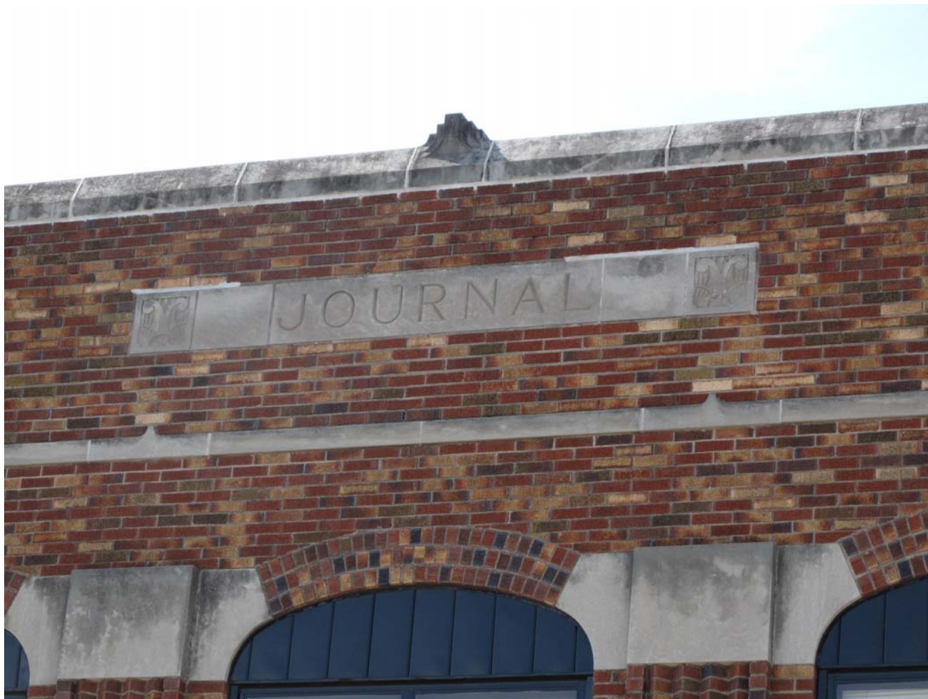
Photograph 92-00551-003 - Detail on east elevation, looking west.