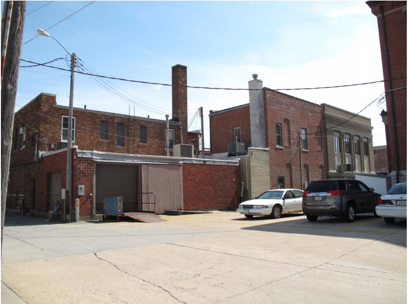
Photograph 92-00551-005 - West elevation, looking southeast.