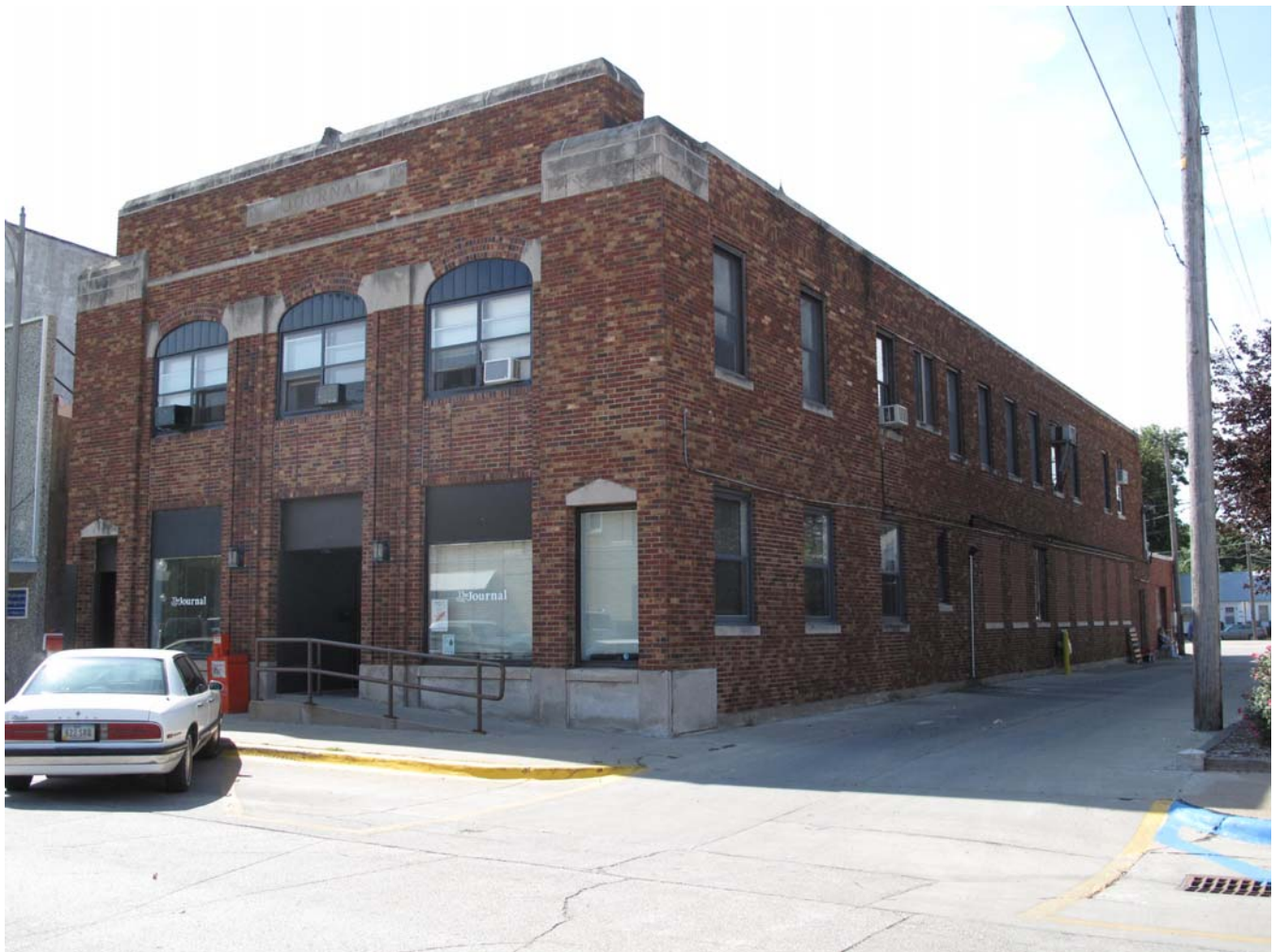
Photograph 92-00551-001 - East and north elevations, looking southwest (, September 20, 2011).