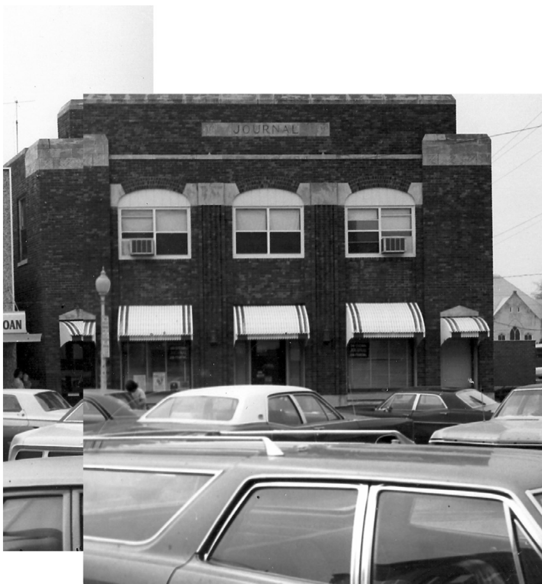
Collage of 1971 photographs (Wagner 1971).