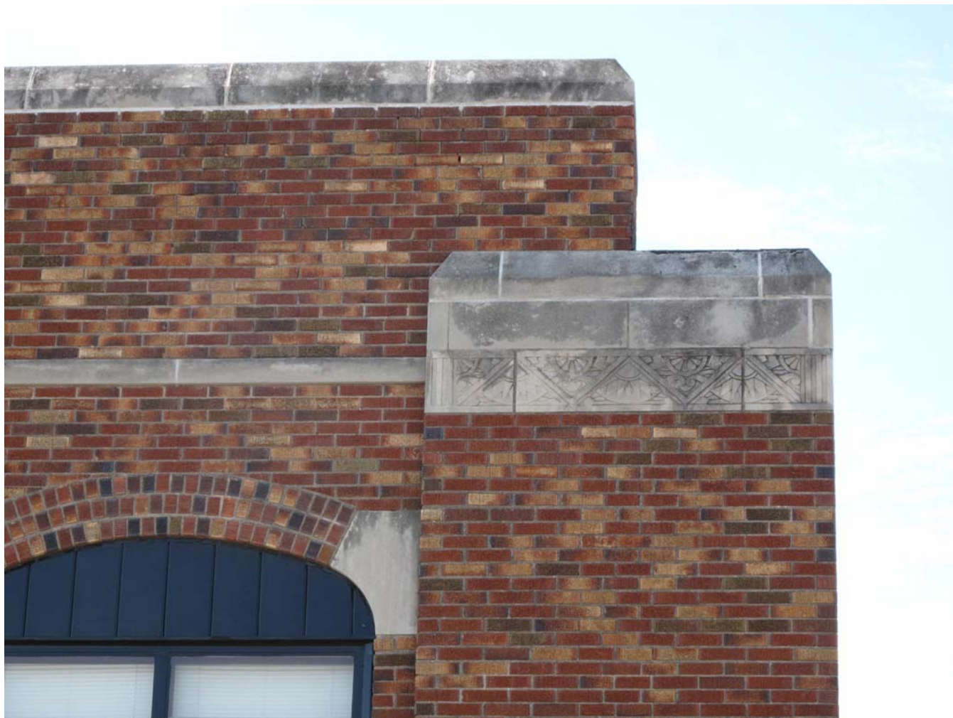
Photograph 92-00551-004 - Detail on east elevation, looking west.