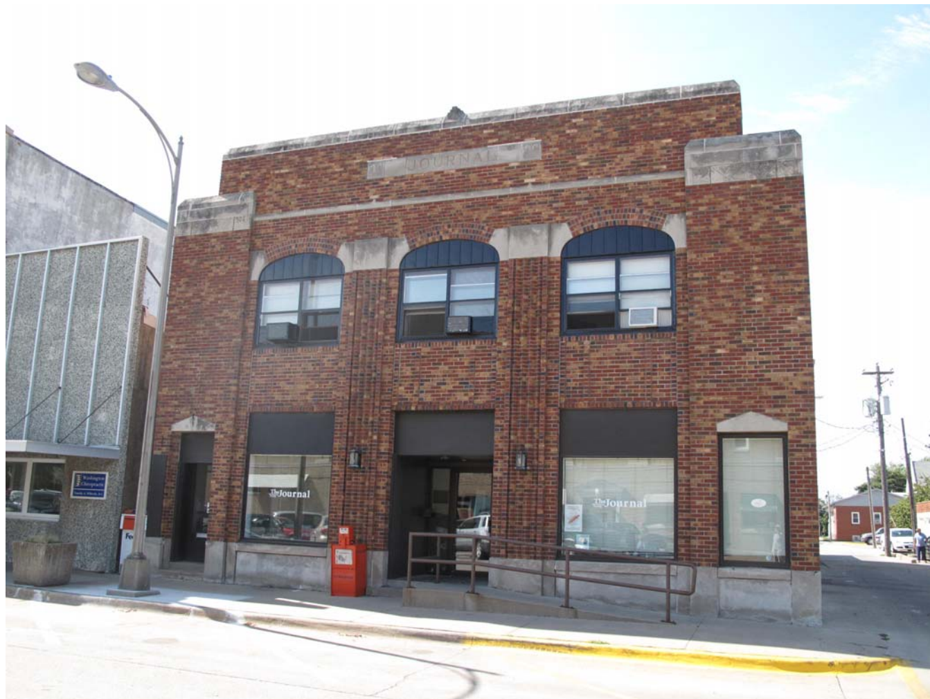
Photograph 92-00551-002 - East elevation, looking west.