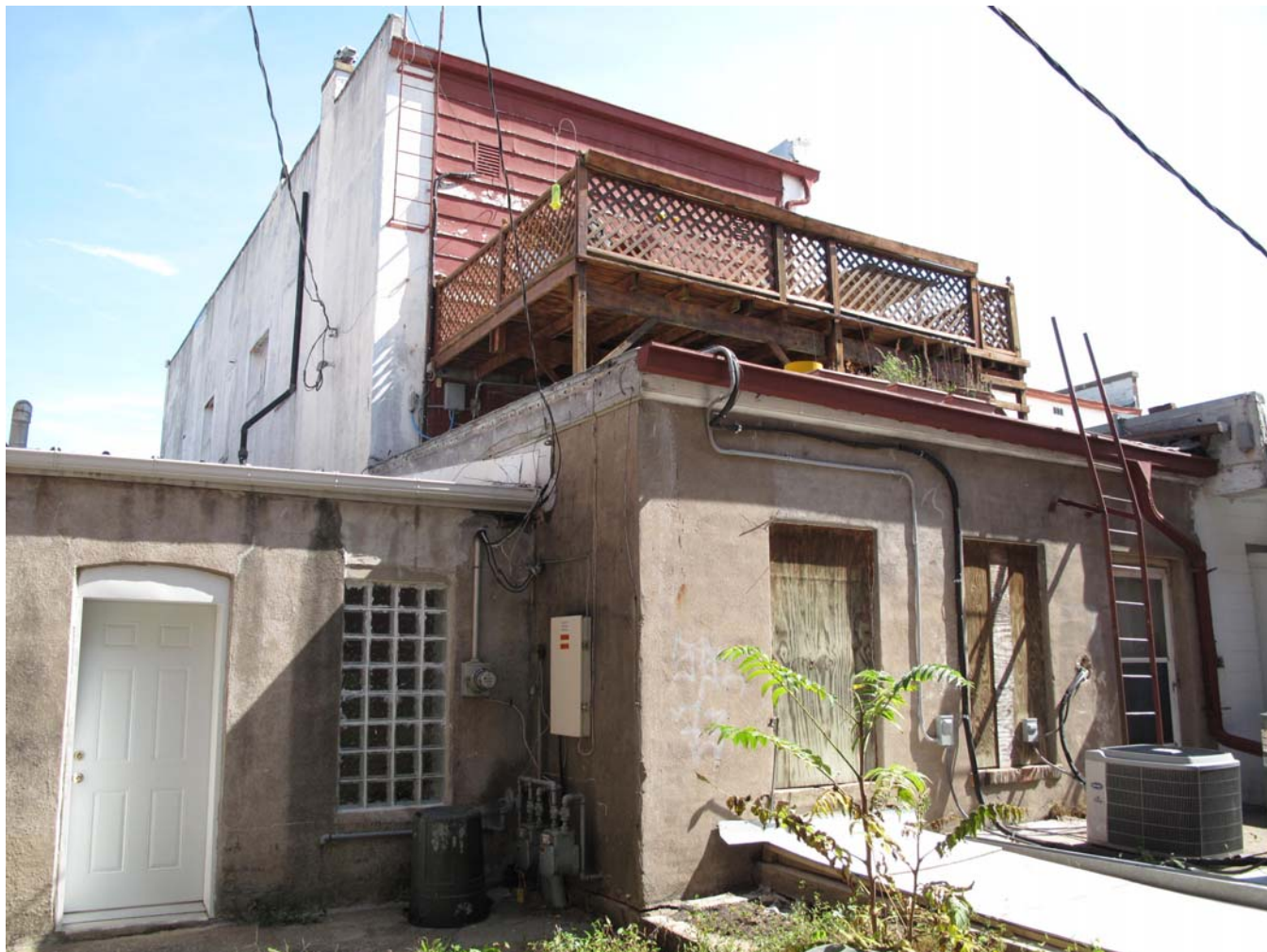
Photograph 92-00549-002 - West elevation, looking southeast.