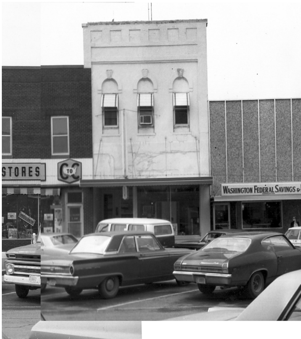
Building in 1971 (Wagner 1971)