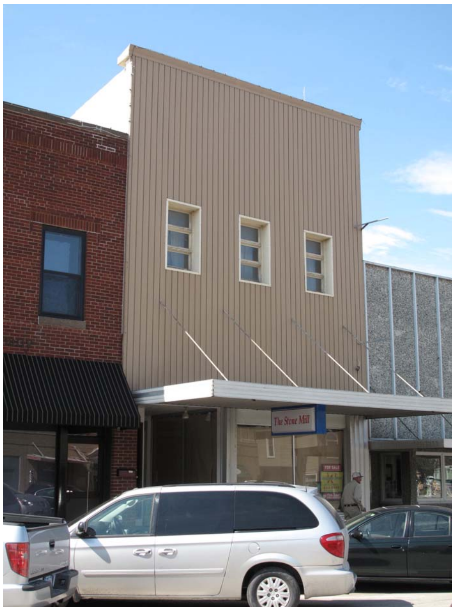
Photograph 92-00549-001 - East elevation, looking northwest.