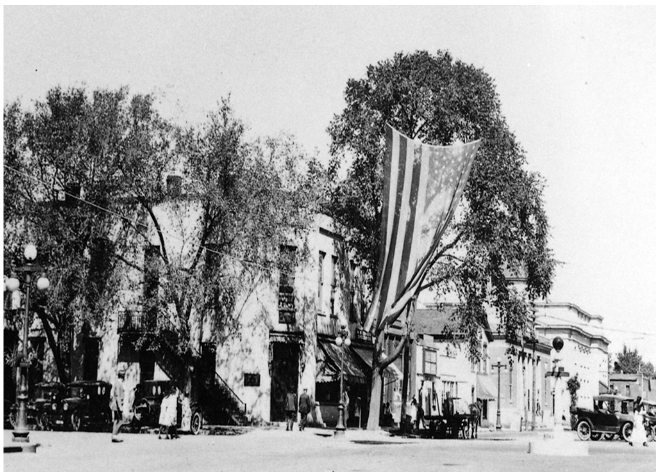
100 block of N. Marion with building at left/corner around 1918.