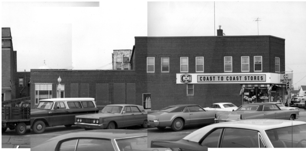
Building in 1971 (Wagner 1971).