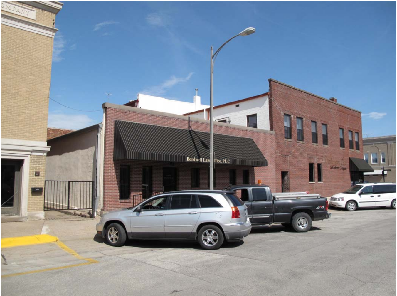
Photograph 92-00575-003 - West and south elevations, looking northeast.