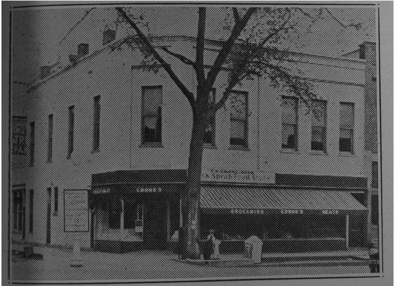
Building after remodeled to single storefront ( Journal , July 1936, 109).