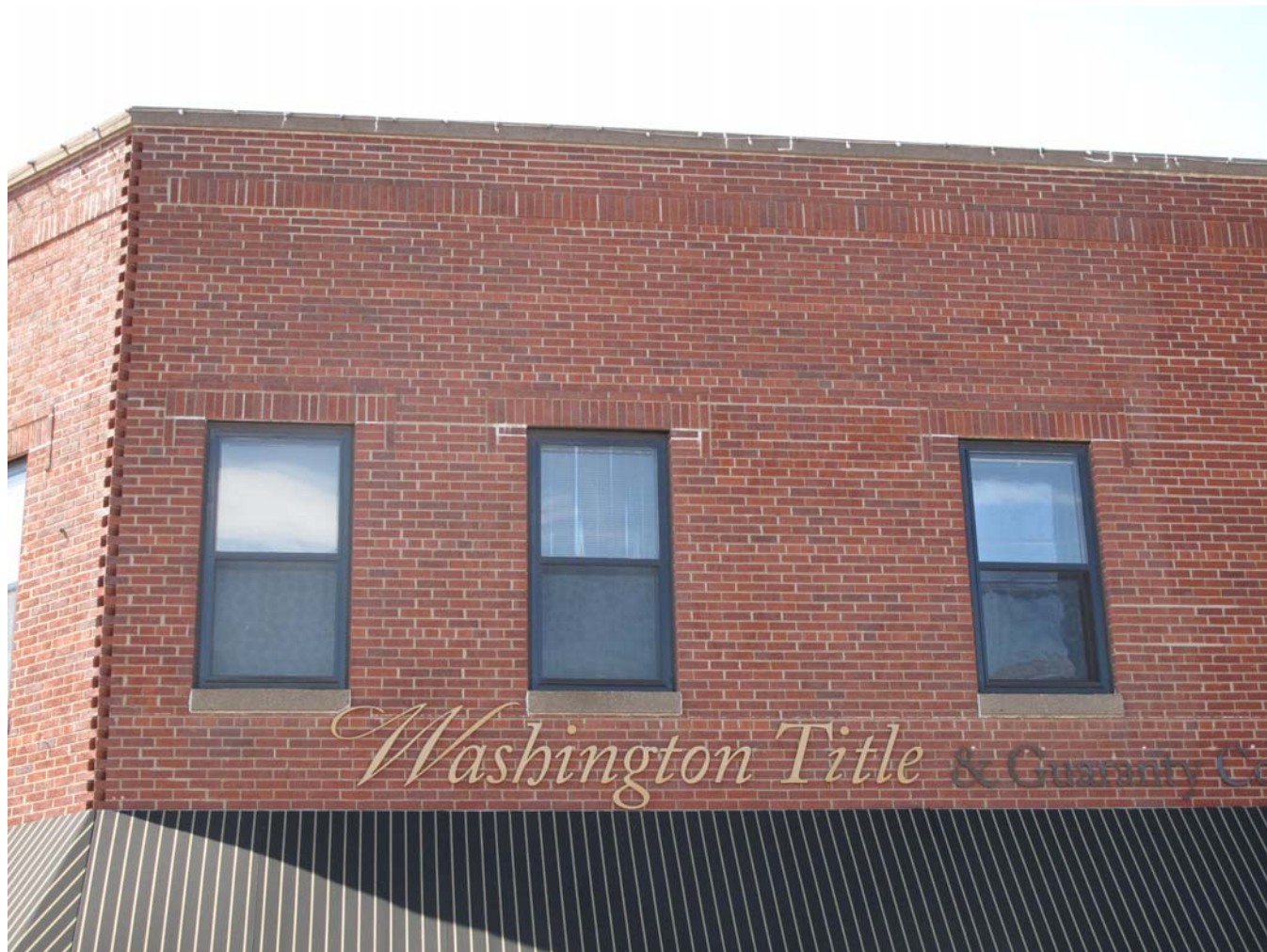
Photograph 92-00575-002 - Detail on east elevation, looking west.