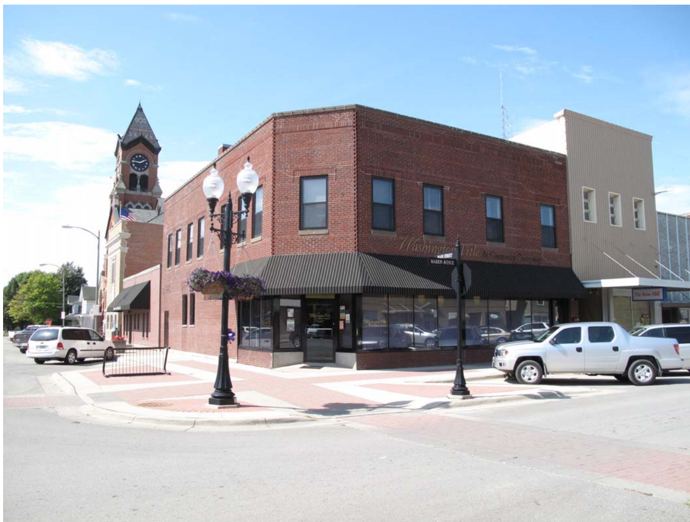
Photograph 92-00575-001 - South and east elevations, looking northwest.