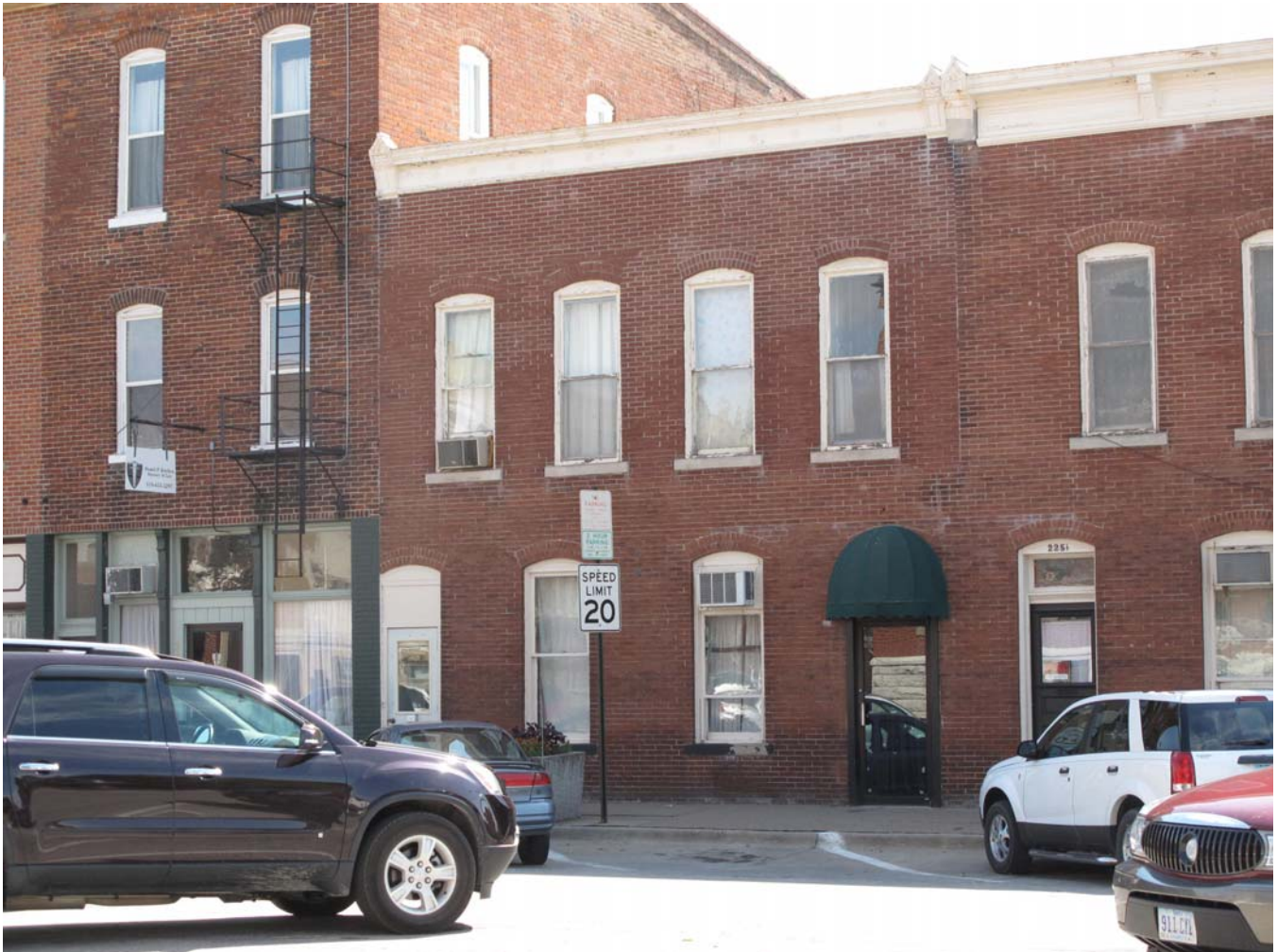
Photograph 92-00546-001 - Front (north) elevation of building, looking southeast (, September 20, 2011)