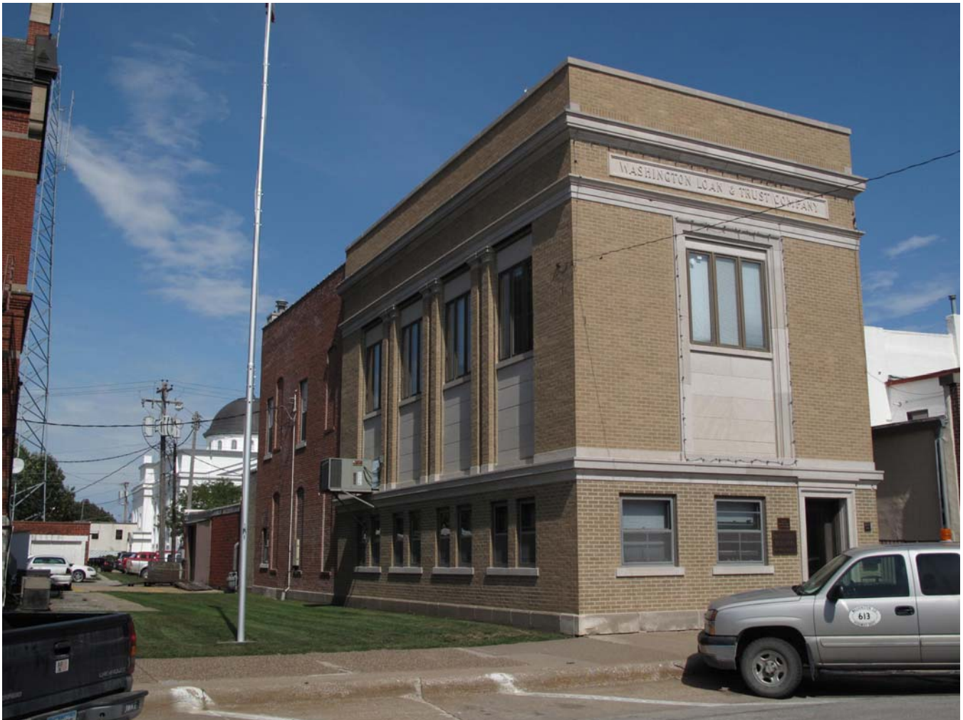
Photograph 92-00544-001 - West and front (south) elevations, looking northeast.