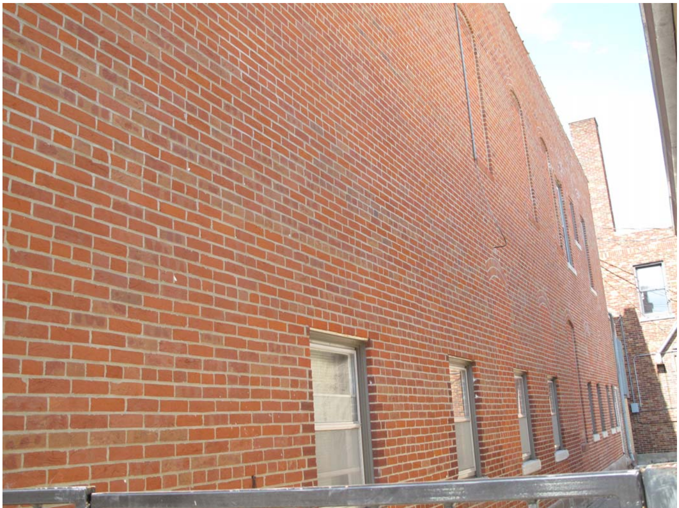
Photograph 92-00544-003 - East elevation, looking northwest (, September 20, 2011).