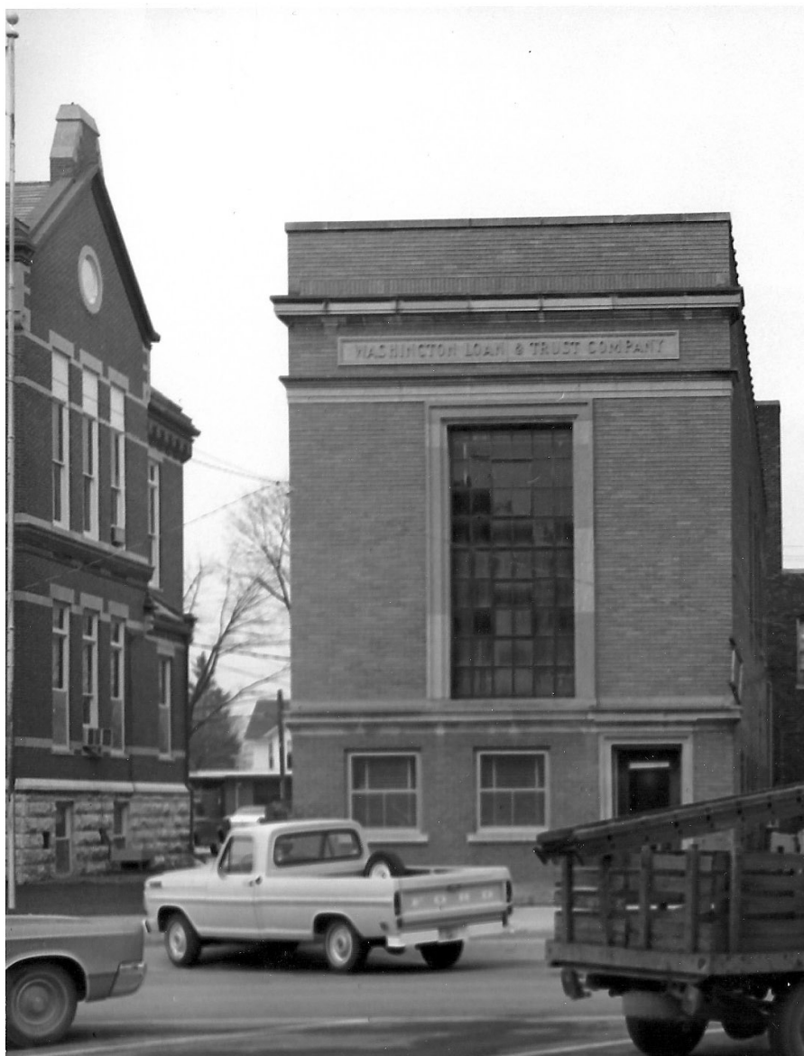
Building in 1971 (Wagner 1971).