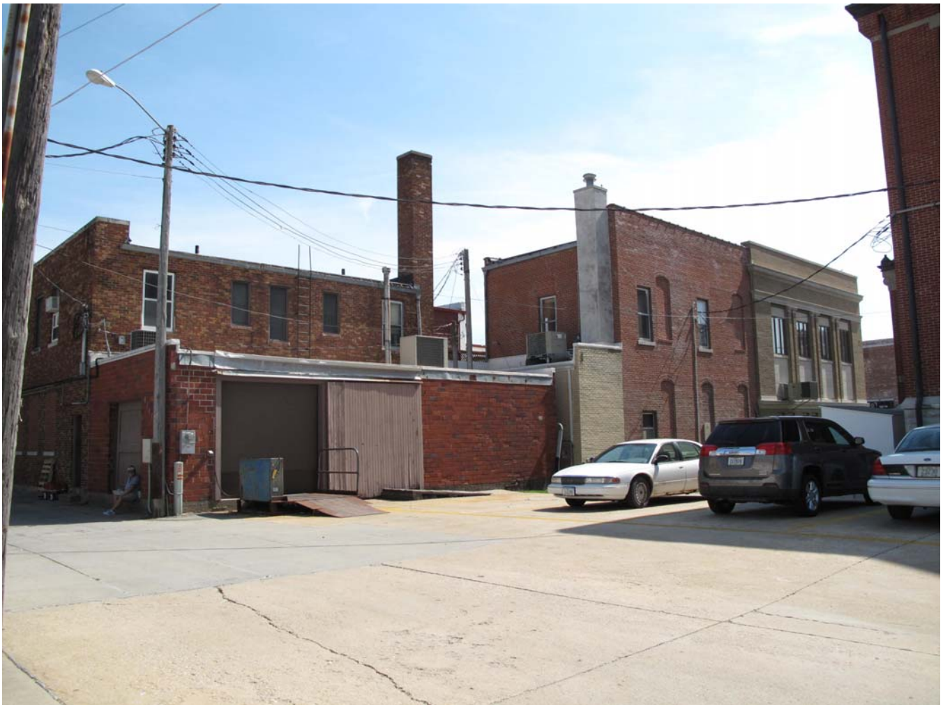
Photograph 92-00544-002 - Rear (north) and west elevations, looking southeast.